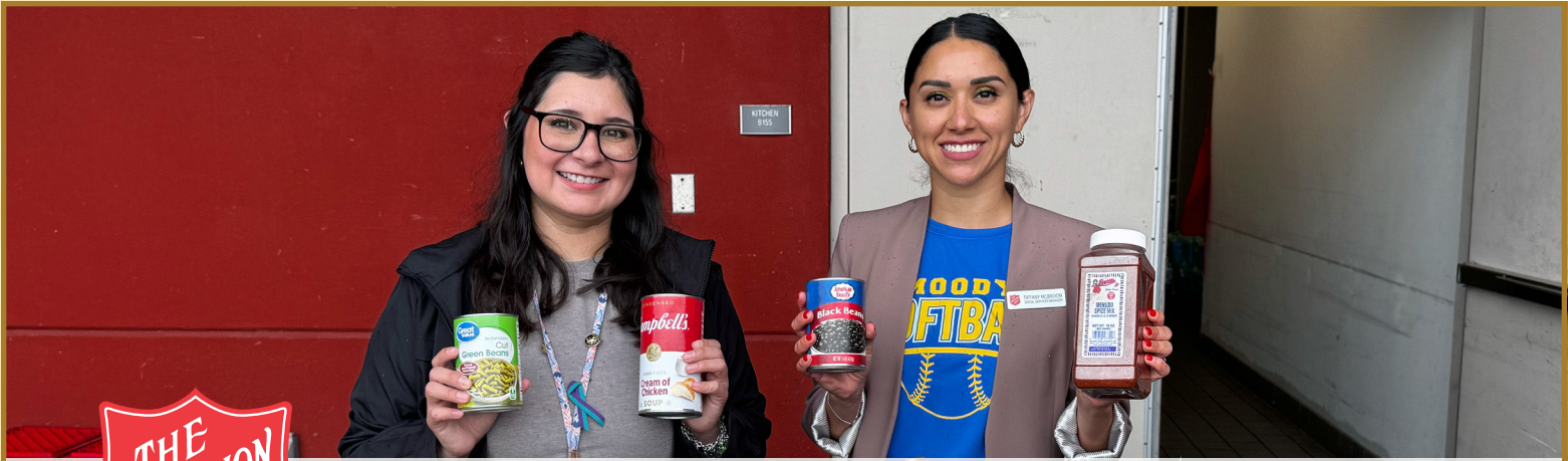
MOODY HIGH SCHOOL DONATING CANNED GOODS TO CENTER OF HOPE SHELTER