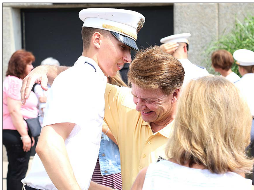
(Above) A Class of 2022 cadet celebrates with his family after officially joining the U.S. Military Academy Corps of Cadets during the Acceptance Day Parade Aug. 18. (Left) Cadets from the Class of 2022 march on The Plain with the view of the Cadet Chapel in the background during the Acceptance Day Parade Aug. 18.