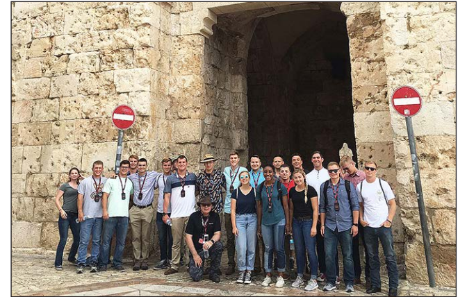
USMA Cadets at Zions Gate in Old Jerusalem, Israel during a trip in July. The gate still has shell marks from fighting in 1967 during the Six-Day War.