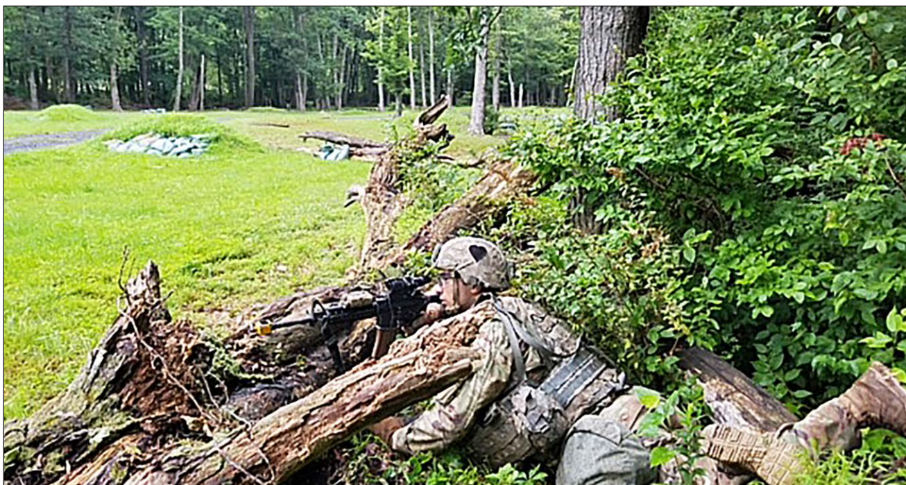
A Renegade Soldier lifts fire during a blank iteration of the Squad Live Fire Exercise to allow the assaulting team to maneuver onto the objective.

Throughout the three days of training, squads executed Troop Leading Procedures before every mission building detailed terrain models and conducting rehearsals to ensure mission success. Soldiers described the event as being “tough