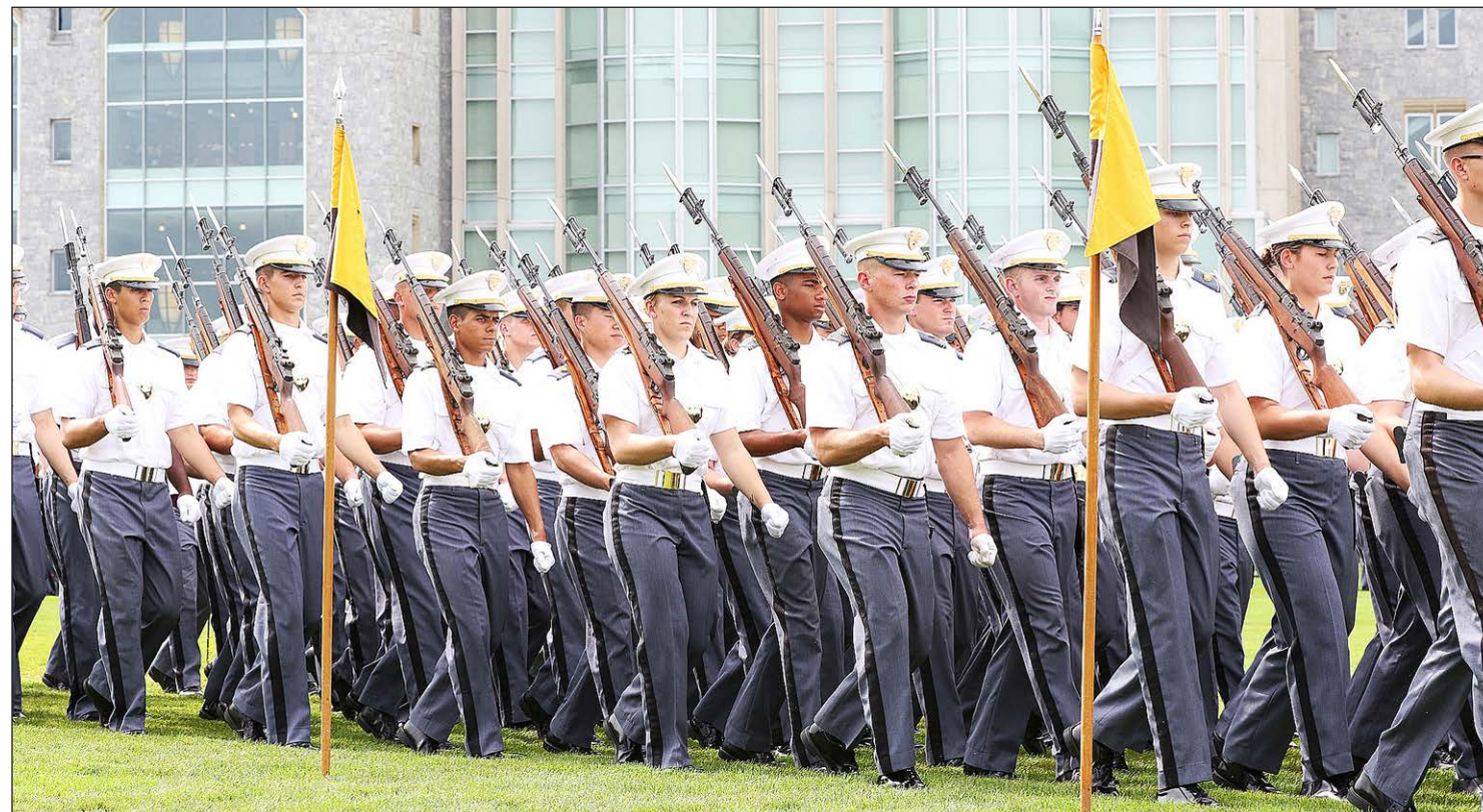
The U.S. Military Academy Corps of Cadets accepts 1,192 members of the Class of 2022 during the Acceptance Day Parade Aug. 18 on The Plain.