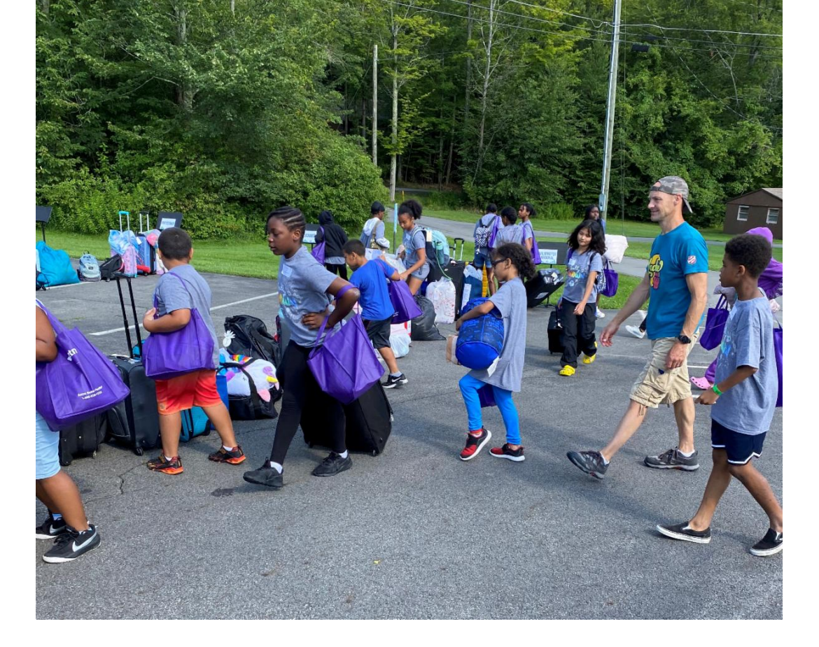
"Campers" loading up to head home after a wonderful week at Camp Ladore.

Each Summer we offer dozens of children in Delaware, some who have never been out of the City, a chance to spend a week at The Salvation Army's Camp Ladore in the Poconos. Camp provides young people of varying backgrounds recreation (swimming, boating, arts, crafts) and time to learn about each other, themselves and their world while living and playing together.