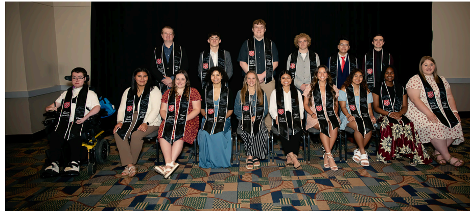
The D.J.'s Hero Awards Class of 2023

Since 2001, The Salvation Army has given D.J.'s Hero Awards scholarships to 206 Nebraska high schoolers.