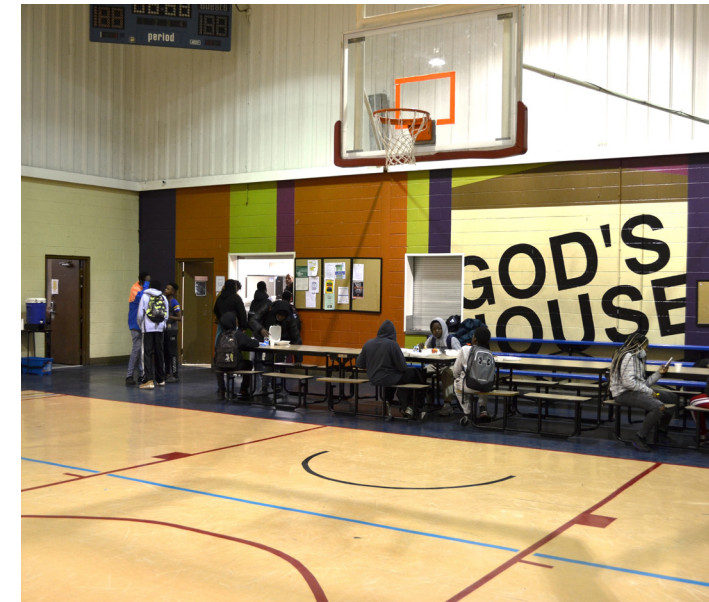
Current North Corps gym.

As with all major building projects, the North Corps plans must go through official City of Omaha approval processes before any construction can begin. On Aug. 2, the Planning Board approved the plans unanimously. As of this writing, the project is set for City Council consideration in late summer.