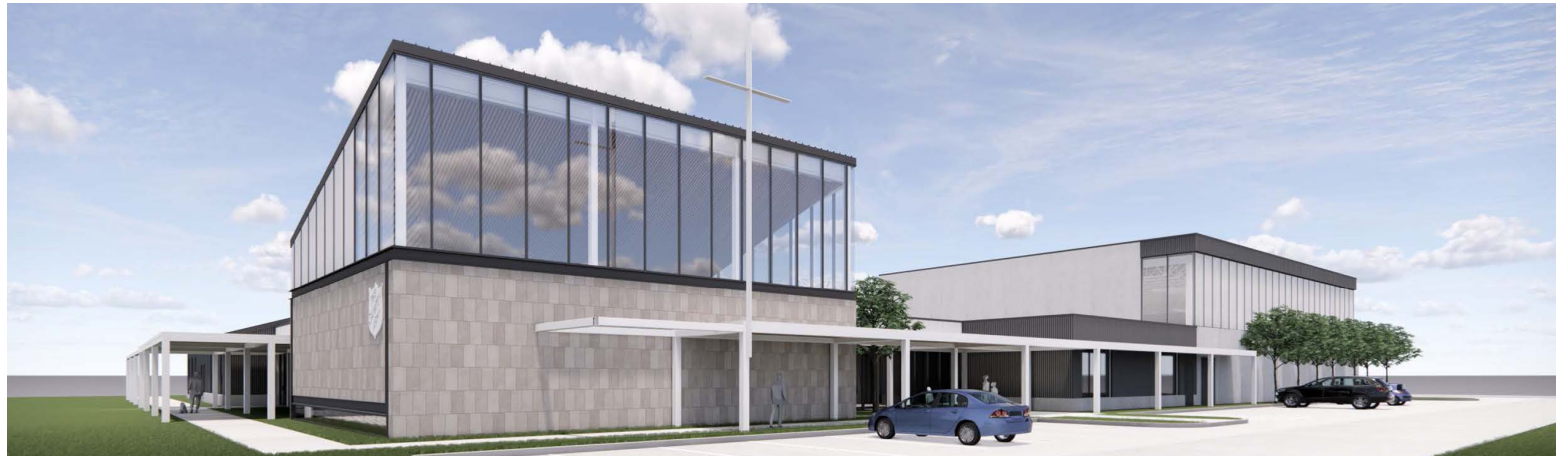
Artist rendering of new North Corps facility. View is from corner of 24th and Manderson streets.

For decades, The Salvation Army North Corps (better known to staff and clients as “The SAL”) has faithfully served the community — but its facilities are no longer adequate. Not only is the building old and inefficient, but it is also too small for the level of need that staff there are facing nowadays.