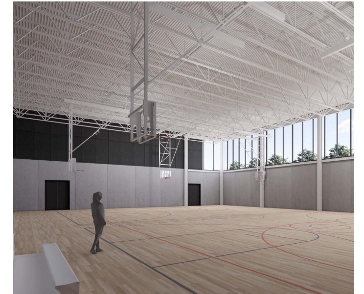
Artist rendering of new North Corps gym.