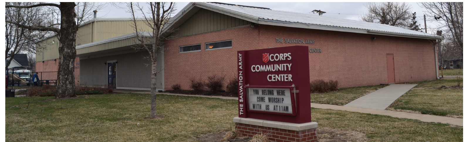
Current North Corps facility.