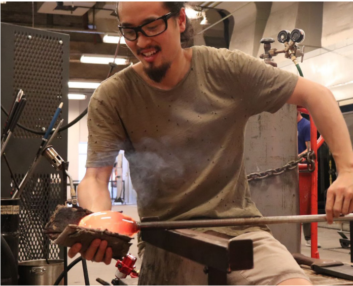
Artist: Kazuki Takizawa

This experience can be paired with any of the following activities