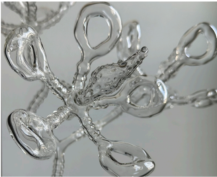
Artist: Celeste Tsang

Work must go into an annealer overnight, and will be available for pick-up after 5 business days.