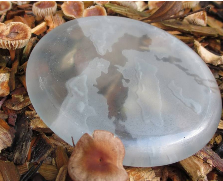
Artist: Austin Davenport Grier

Work must go into an annealer overnight, and will be available for pick-up the following day.