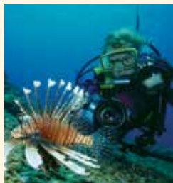
“Extraordinary conference... most enjoyable learning experience I have ever encountered.”