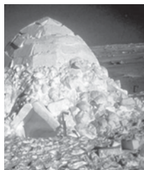
Learn to build igloos and other snow shelters