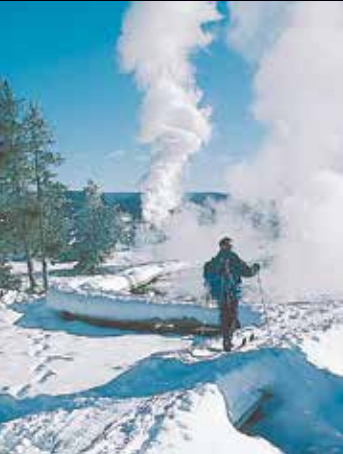
Cross-country skiing is fantastic at Big Sky and nearby Yellowstone

Ski Lift Tickets: Discounted Ski Lift Tickets: Single and multi-day discounted lift tickets can be purchased online at wilderness-medicine.com . Single day discounted lift tickets may also be purchased onsite. Kids 10 and under ski free with a paying adult.