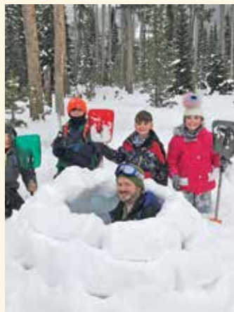
Children and Teens learn how to construct igloos, snow caves and other improvised shelters

Let the Kids Escape You: Big Sky offers an array of children's activities ranging from ski schools to dog rescue demonstrations, to regular evening movies. And kids 10 and under ski free!