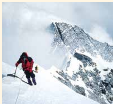
Climbers approach the summit of Everest as the deadly storm rolls in.