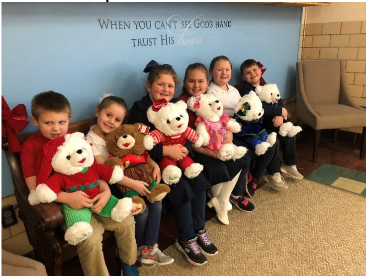
Coloring Contest winners for Come Home to Galion from St. Joseph School