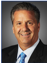
JOHN CALIPARI Head Coach 12th Season @UKCoachCalipari @ukcoachcalipari @UKCoachCalipari (cal-uh-PEAR-ee)