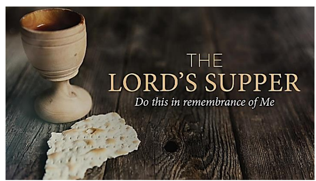
Sunday, April 2nd