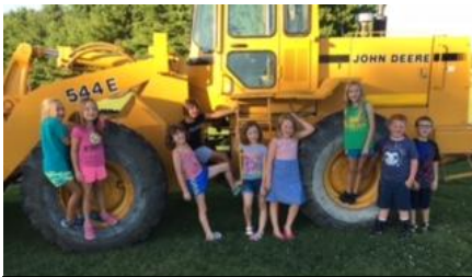
Concrete & Cranes VBS