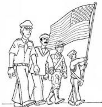
Honoring America's Veterans on Veteran's Day

We owe so much to them, Who kept us safe from terror, So when we see a uniform, Let's say "thank you" to every wearer.