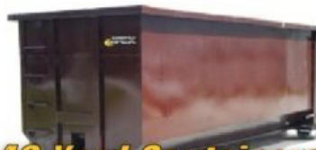
40 Yard Containers