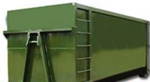
40 Yard Containers

Apex Equipment Sales, Inc. 1425 33rd Street West Palm Beach, FL 33407 Office: 561-842-0111 Fax: 561-842-0103 www.apexequipment.com