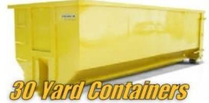
30 Yard Containers