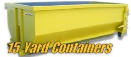
15 Yard Containers