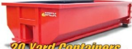
20 Yard Containers