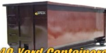
40 Yard Containers