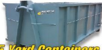
15 Yard Containers