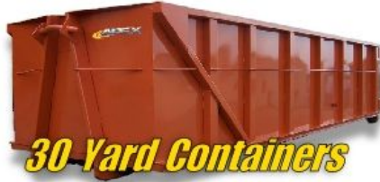
30 Yard Containers