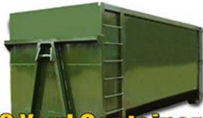
40 Yard Containers

Apex Equipment Sales, Inc. 1425 S.W. 2nd Street West Palm Beach, FL 33407 Office: 561-842-0111 Fax: 561-842-0111 www.apexequipment.com