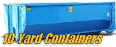
10 Yard Containers