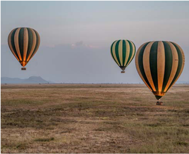
A sunrise balloon drifts over the Mara's grasslands, revealing rivers, acacia clusters, and wildlife below. In early light, the plains open in quiet layers of color and movement.