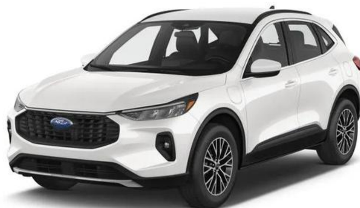
Mid Size SUV