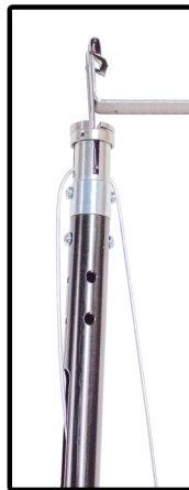
4. Push the joist clip against the flange, locking the teeth into the square hole. Pull straight down, engaging the joist clip to the flange.