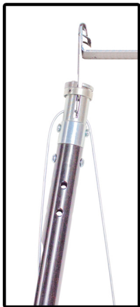
3. Raise tool and fastener assembly above the flange