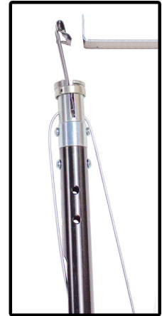
2. Stand in front of the joist.