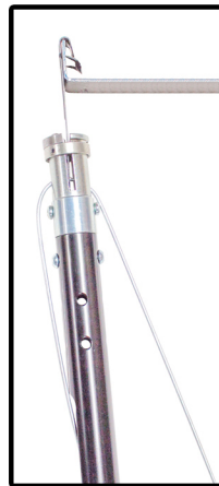
5. To disengage the tool, walk forward to change the angle of the clip in the tool. Lift up after the clip has been set on the joist.