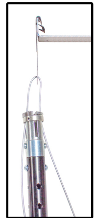
6. Lower the tool as shown above, trapping the wire in the ring.