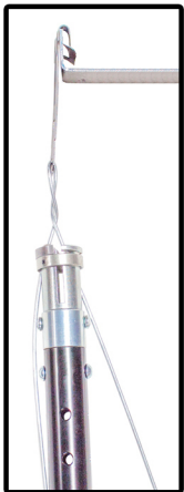
7. While pulling down, rotate the pole tool using any standard power drill.

WARNING: Fasteners must be placed only as illustrated in the figures above. Use only in non-corrosive environments. Misuse or misapplication may cause failure resulting in property damage or bodily injury.