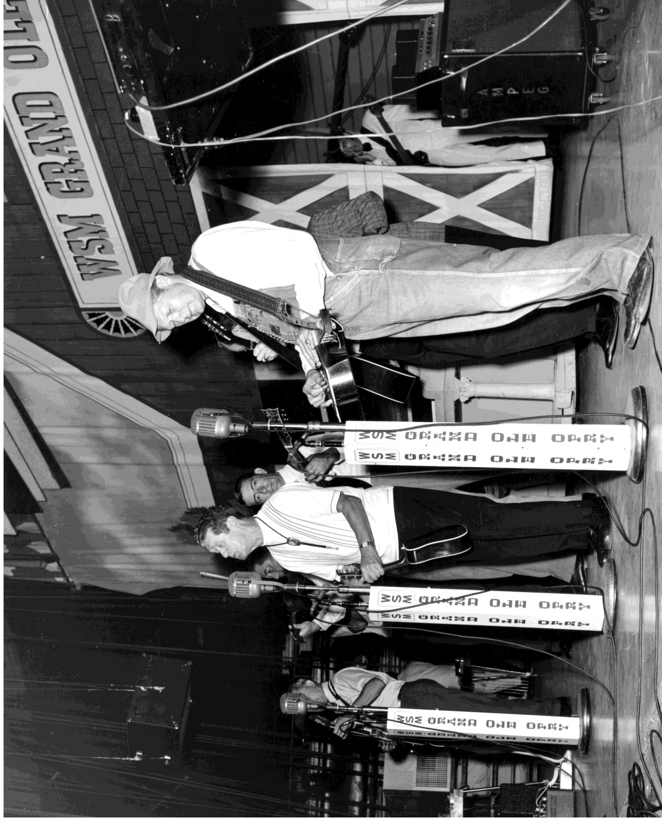
"Roy Acuff and the Smoky Mountain Boys on stage at the Ryman" photograph:

Located in the Tennessee Department of Conservation Photograph Collection, 1937-1976