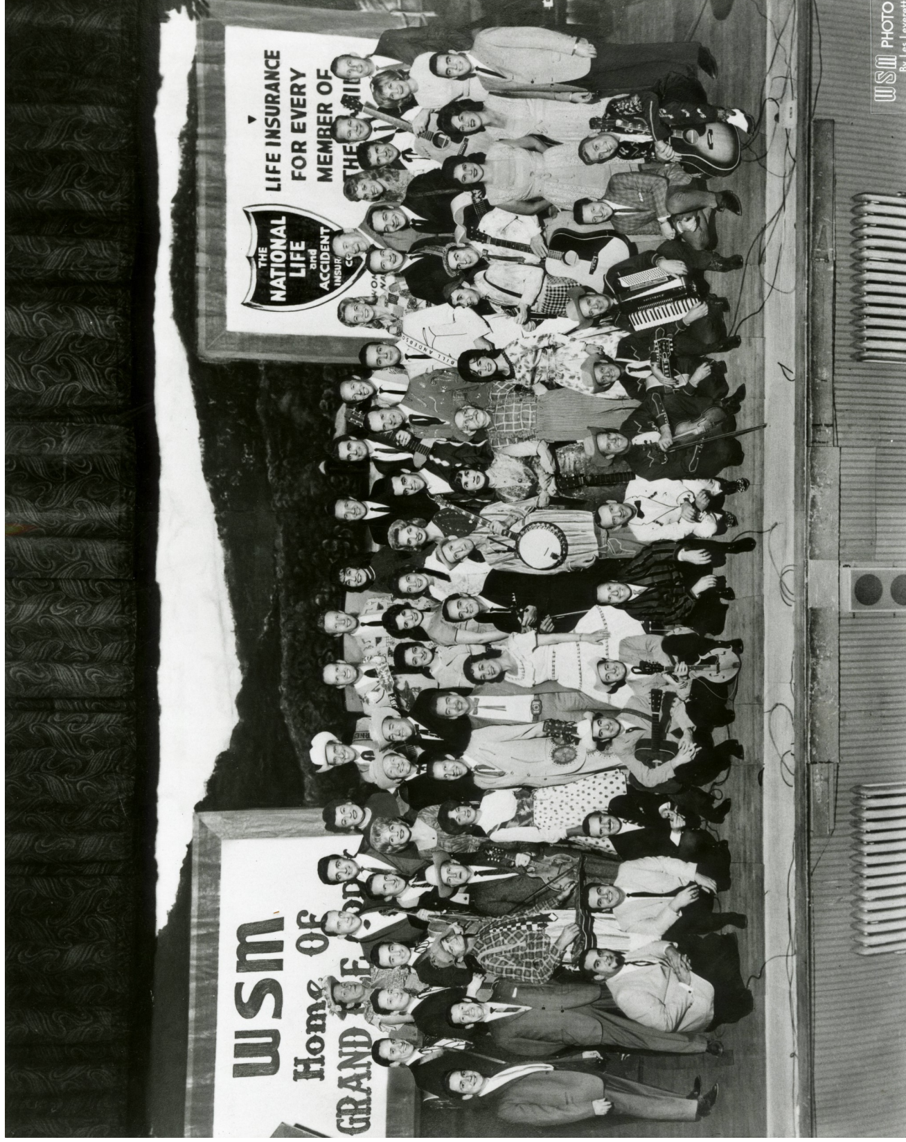
“Grand Ole Opry cast on the stage of the Ryman Auditorium”