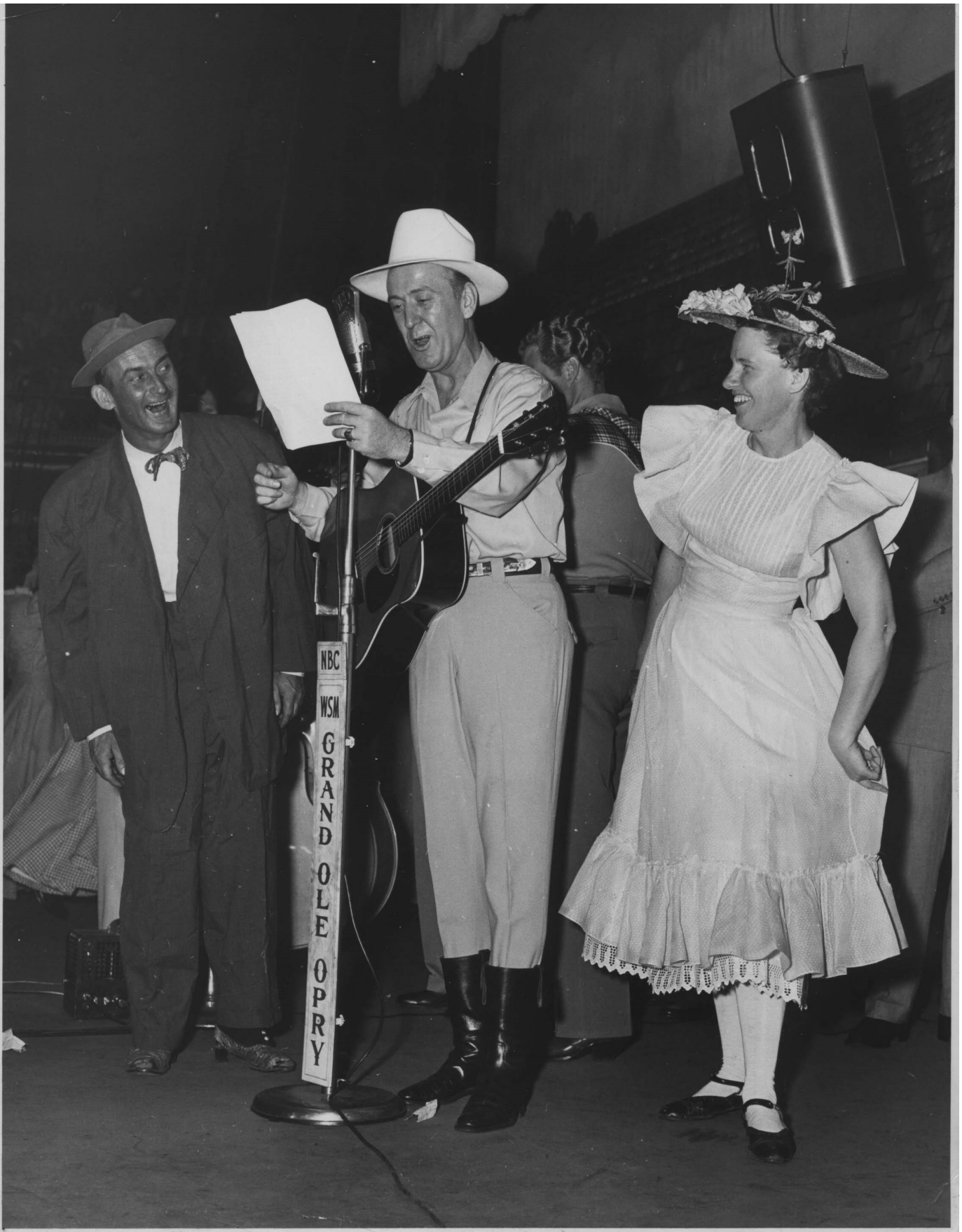
"Minnie Pearl, Red Foley, and Rod Brasfield performing on stage at WSM's Grand Ole Opry in Nashville, Tennessee" photograph:

Located in the Tennessee Department of Conservation Photograph Collection, 1937-1976