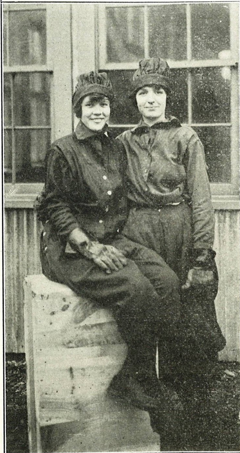
Ready for Work at Box Factory.

“Ready for Work at Box Factory” photograph: