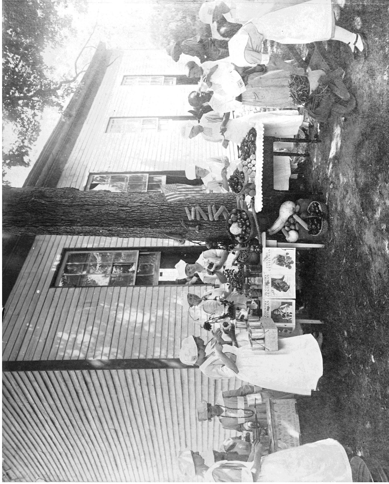
"World War I era canning operation" photograph.

Located in the Looking Back at Tennessee Collection