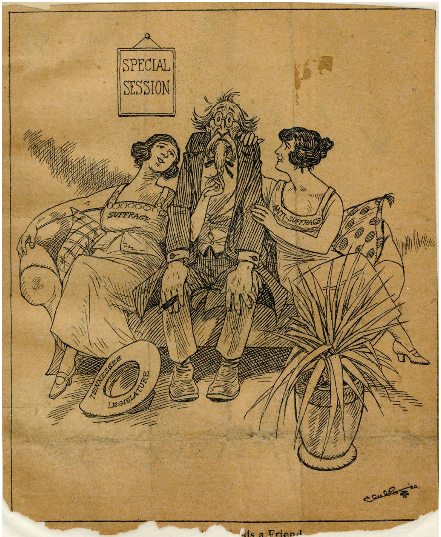
"Special Session" Cartoon from the Rochester Herald , August 11, 1920:

Located in the Carrie Chapman Catt Papers, 1916-1921