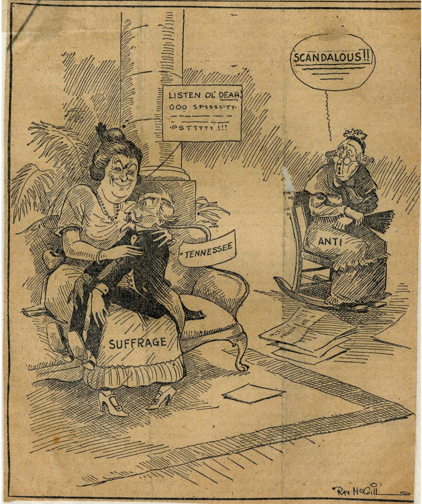
"Where Three's a Crowd" Cartoon from an unnamed newspaper, August 2, 1920:

Located in the Carrie Chapman Catt Papers, 1916-1921