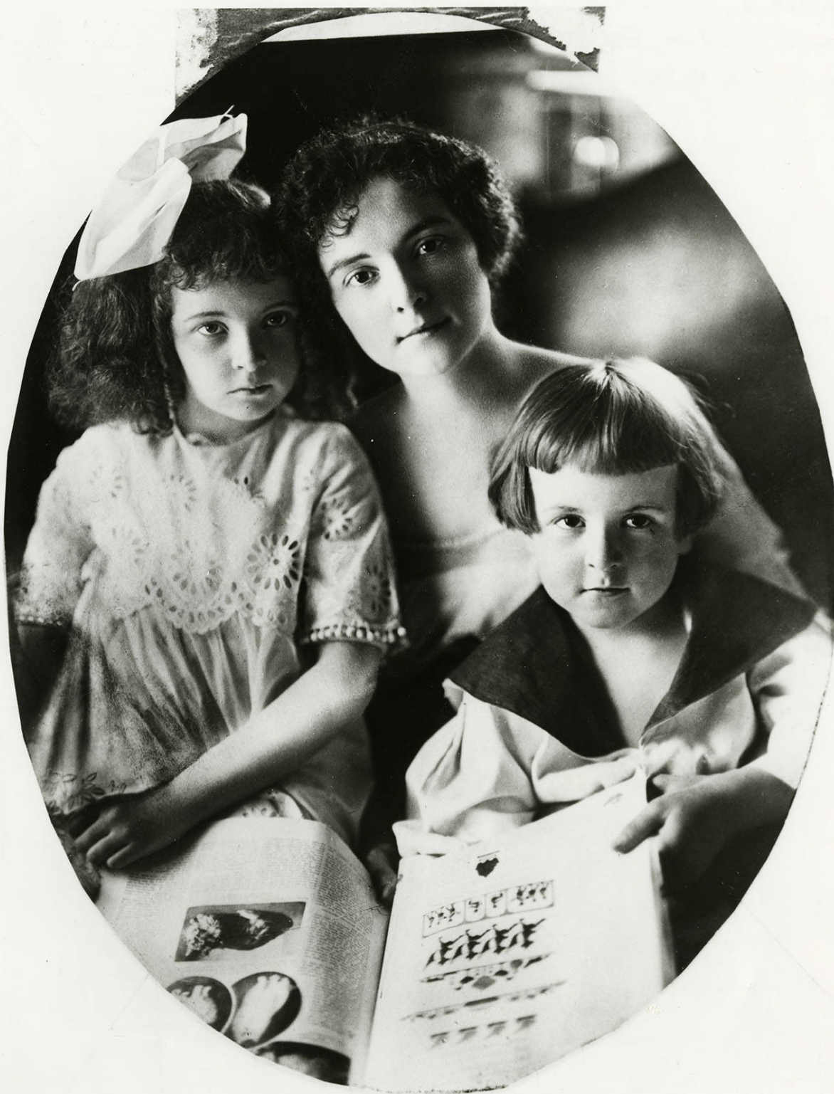
Photograph of Anne Dallas Dudley and children (1876-1955):

Located in the Library Photograph Collection