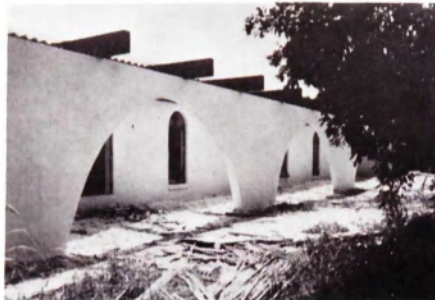
Unity-in-the-Grove, Lakeland, Florida.

Unity-in-the-Grove, Lakeland, Florida , has moved into a newly completed building at 6230 Lakeland Highlands Road , reports Grace G. Hunt , minister. The church moved into the new facility in mid-September after a busy summer of planning and building.