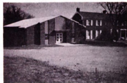
First Church Unity in Nashville, Tennessee

Gene commented, "The one-story unit is at the west end and connected to the original residence structure which has housed a 100-seat chapel and classrooms. It is 40 X 72 feet and includes offices and library."