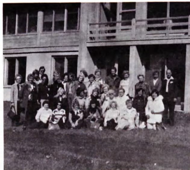
Members and friends of Unity of Roanoke Valley who attended the one-day retreat at the Peaks of Otter Lodge.