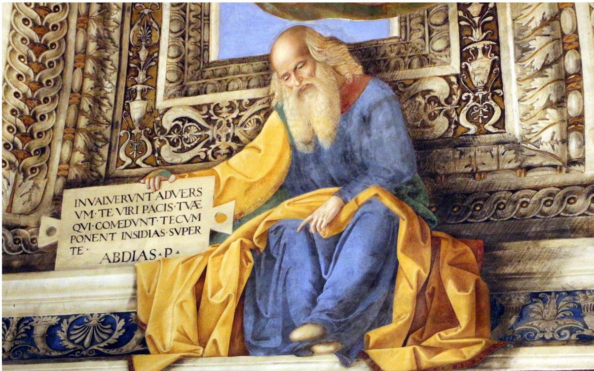
Obadiah: Angels with Symbols of Passion and Prophets. Fresco by Melozzo da Forlì, 1477. Santuario della Santa Casa, Loreto, Italy. Public Domain.