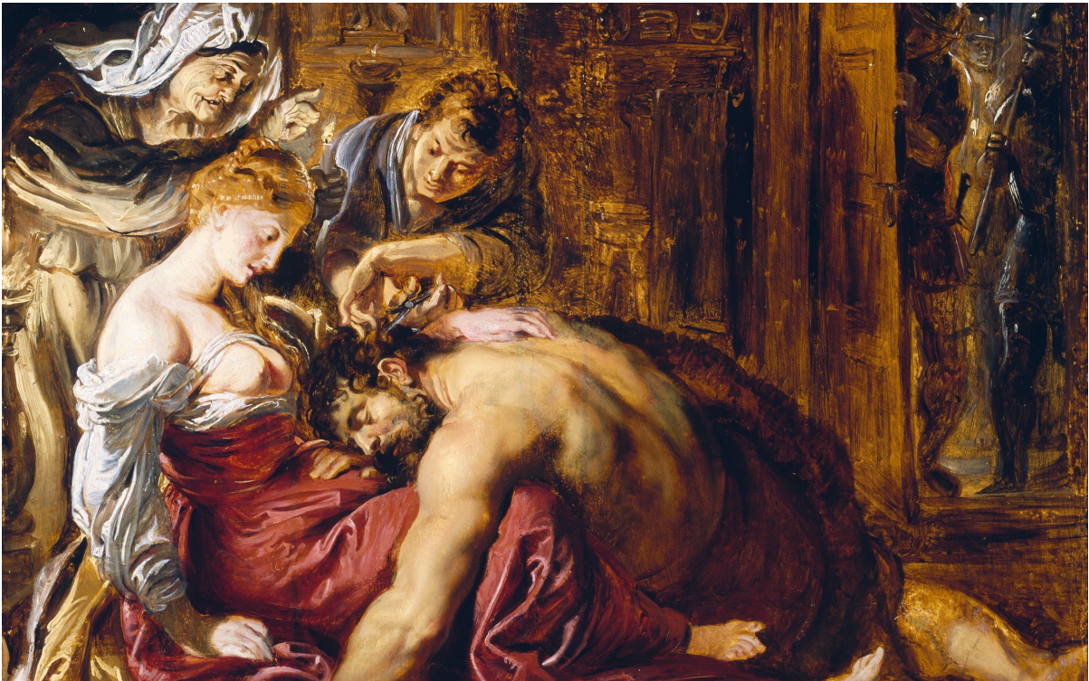
Peter Paul Rubens - Samson and Delilah. Public Domain.