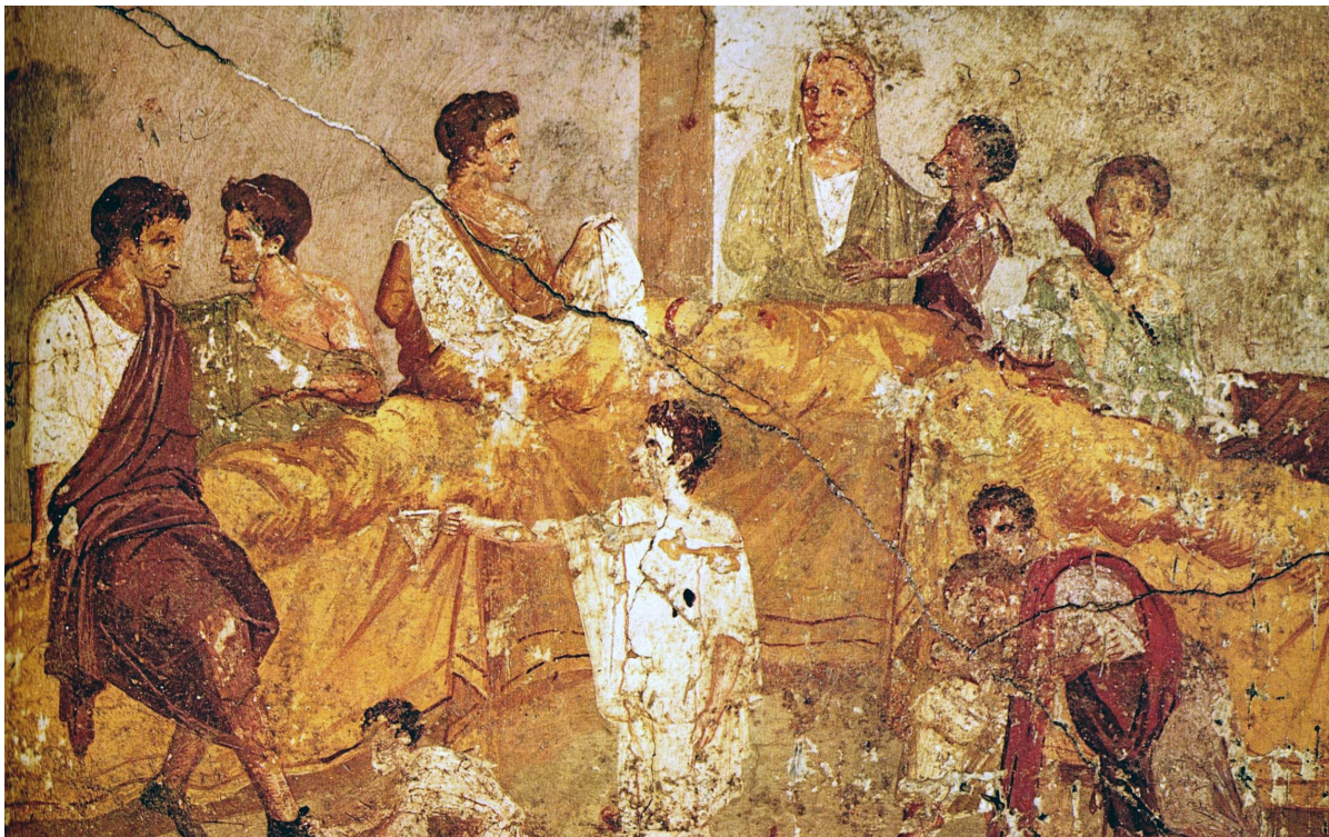
Wall painting (1st century AD) from Pompeii depicting a multigenerational banquet. Museo Archeologico Nazionale, Naples. Public Domain.