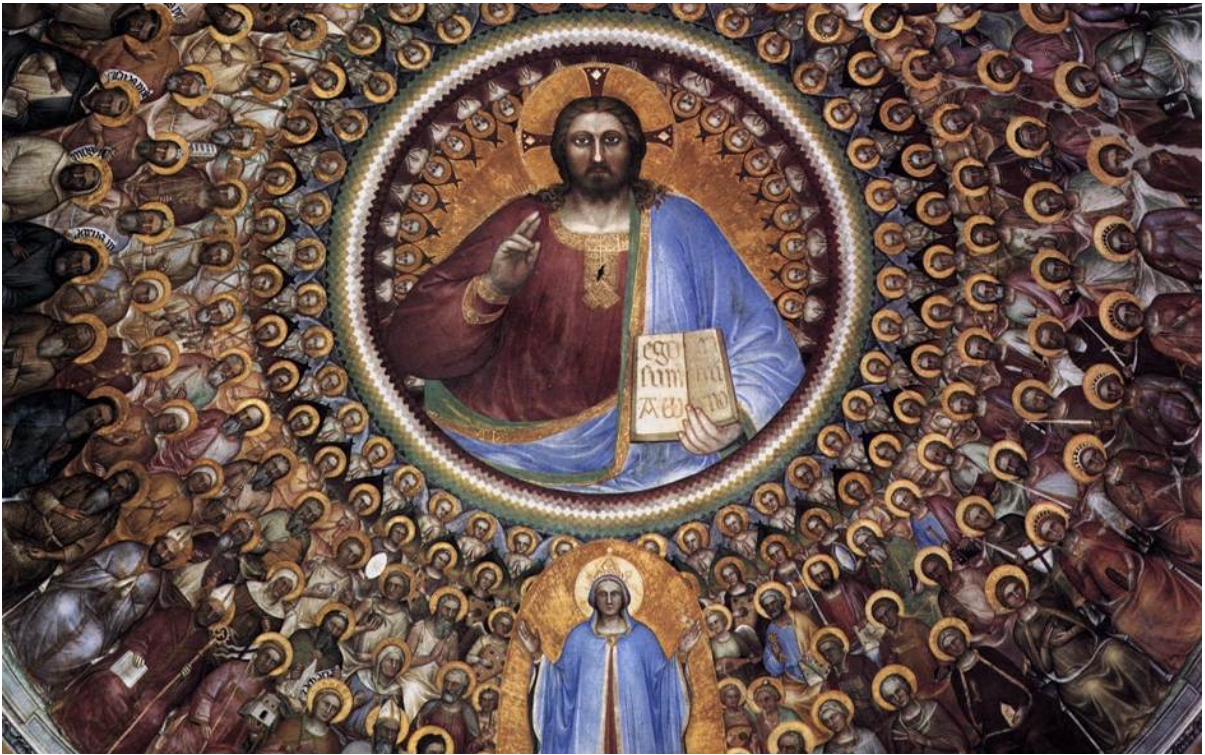
Giusto de' Menabuoi, Paradise, Padua Baptistery's frescoed dome, 1375-1378, Public Domain.