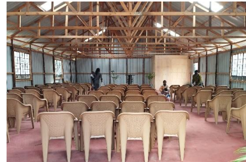
The new sanctuary of Rongai AGUC