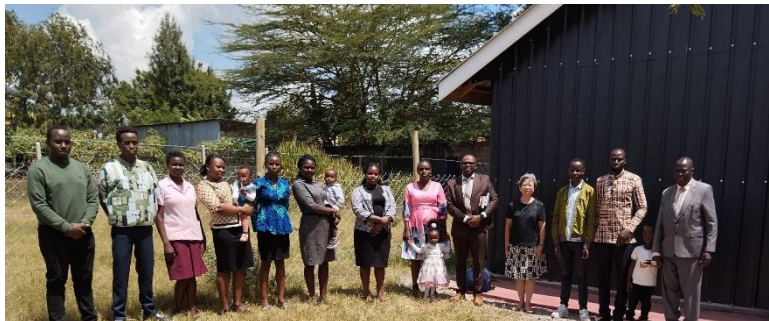
Worshippers at Rongai AGUC