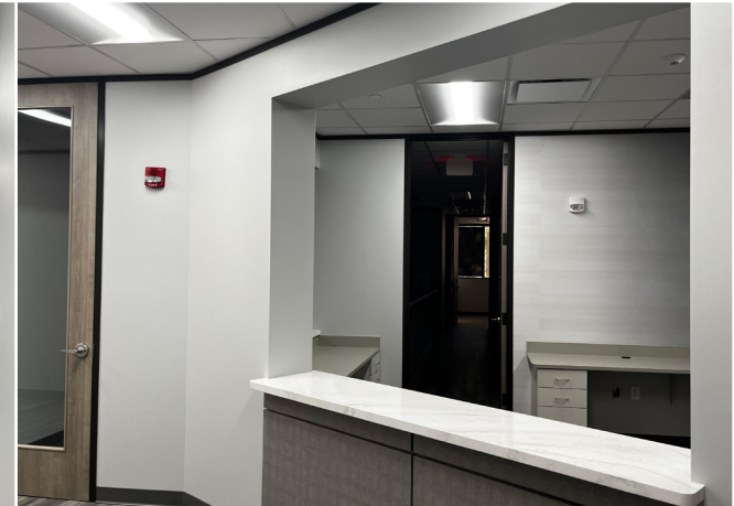
Check-in/Check-out area with clinical work space

* No out of pocket cost for tenant based on 5 year lease term.