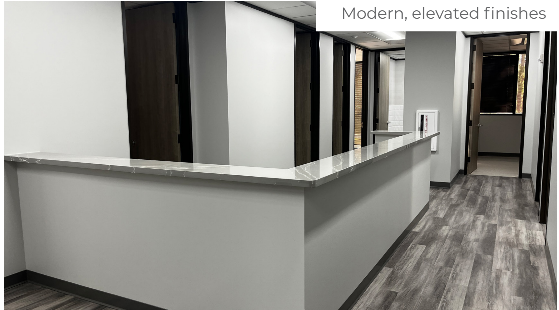
Modern, elevated finishes