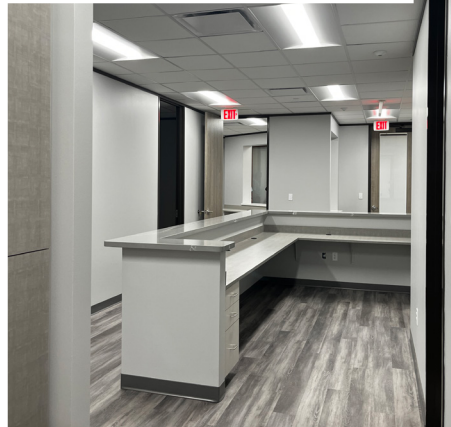
Spacious Nursing Stations