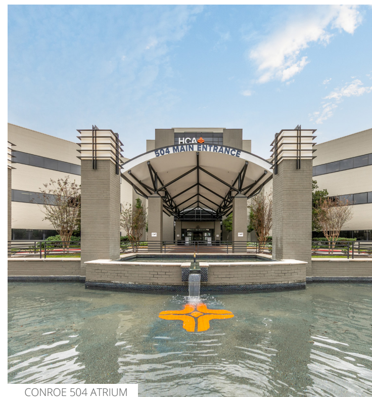
CONROE 504 ATRIUM