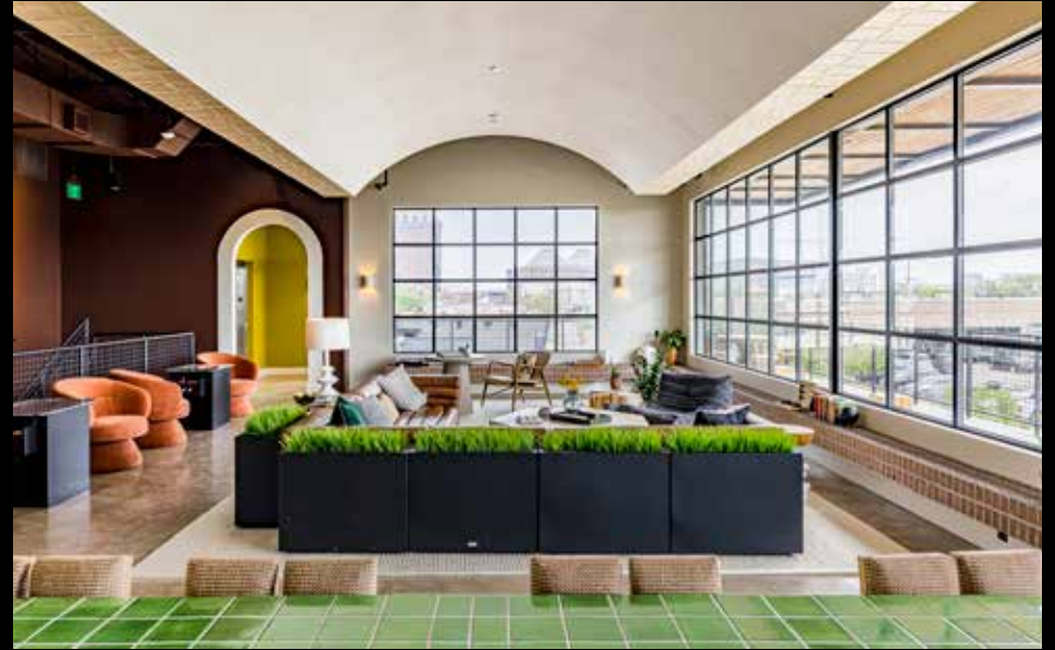
Rooftop Tenant Lounge