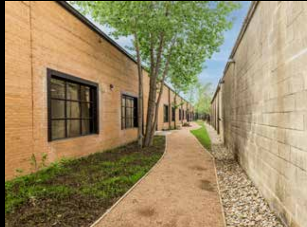
The Rail Spur