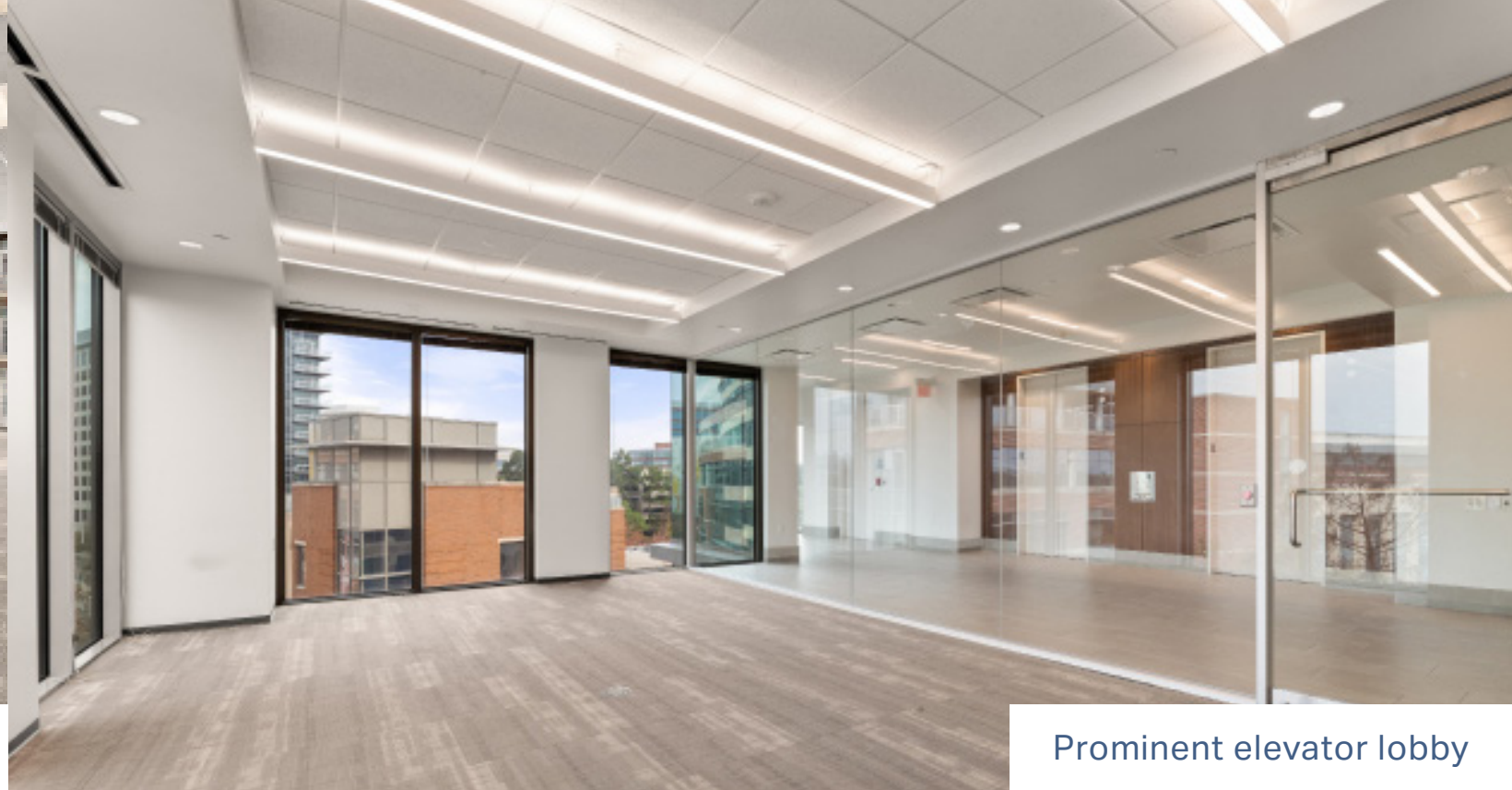
Prominent elevator lobby