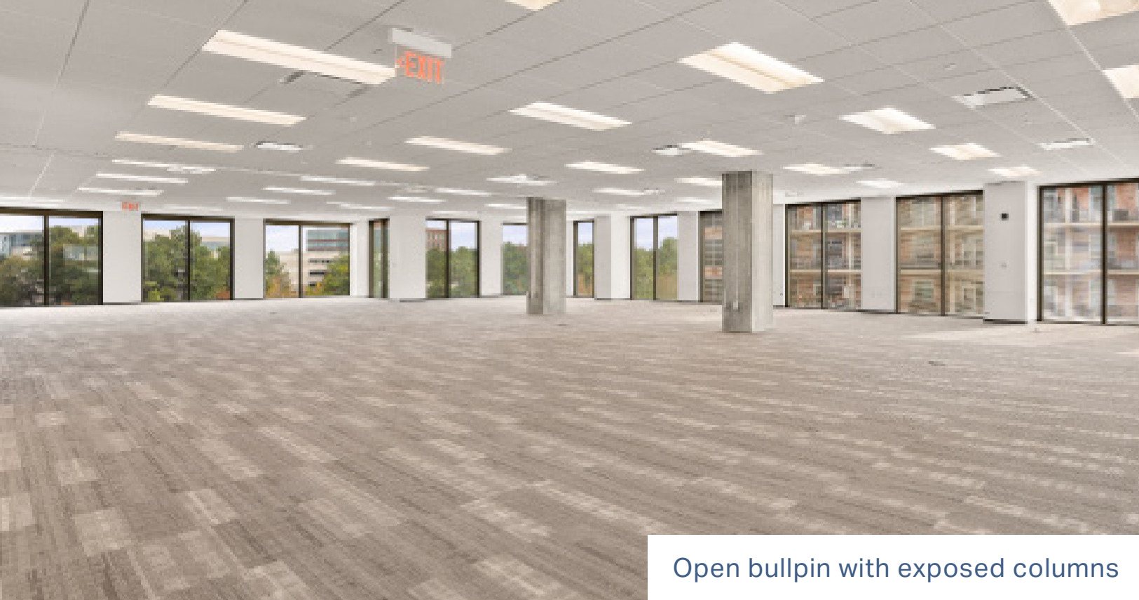
Open bullpin with exposed columns

14,603 SF Available - Full Floor Opportunity