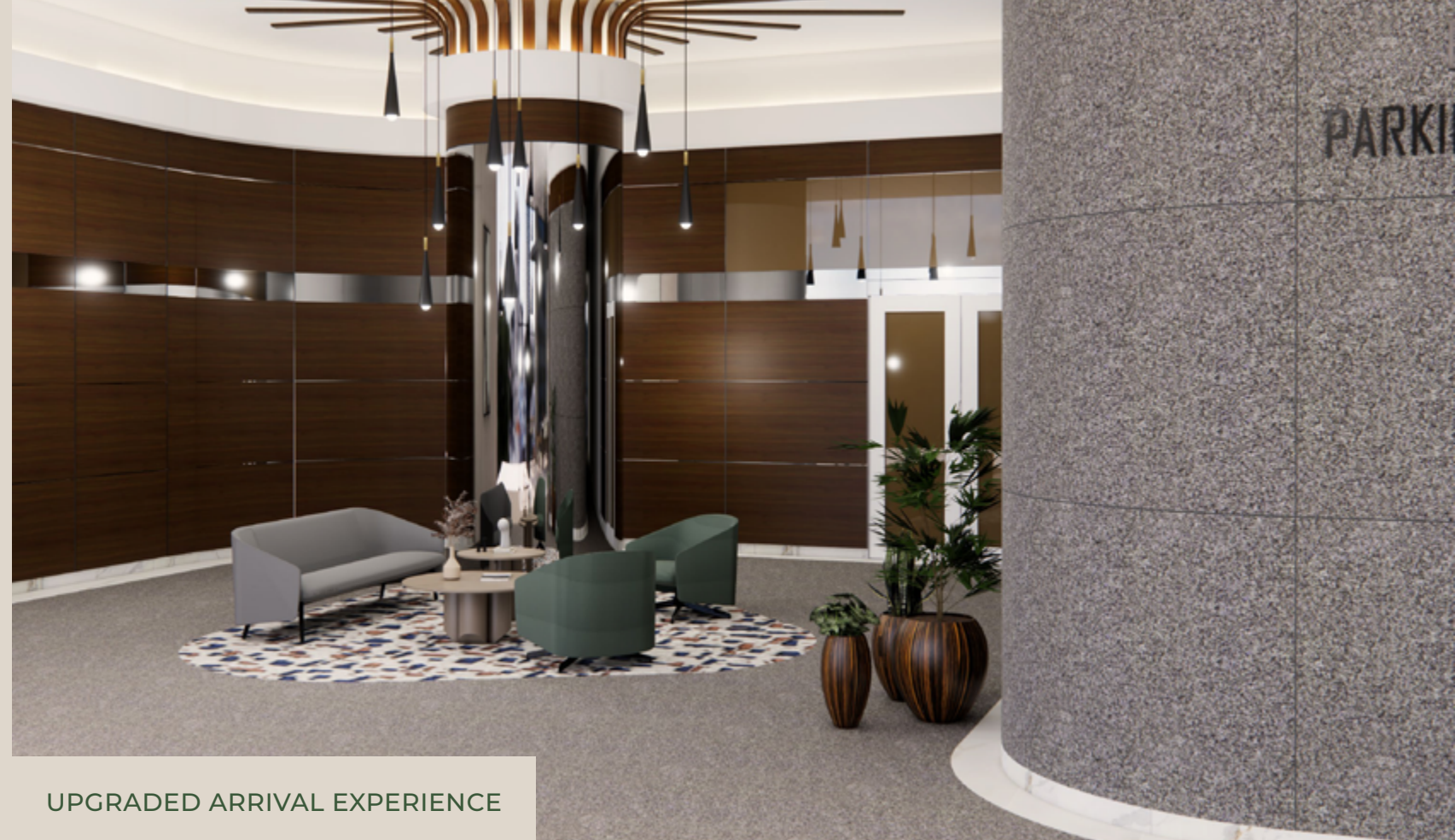
UPGRADED ARRIVAL EXPERIENCE