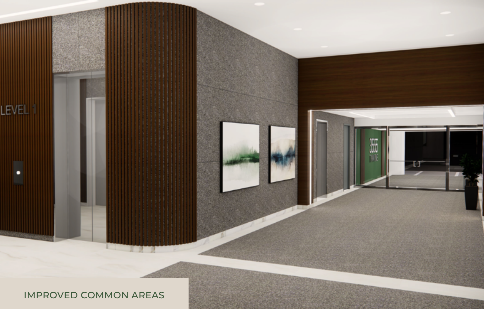
IMPROVED COMMON AREAS