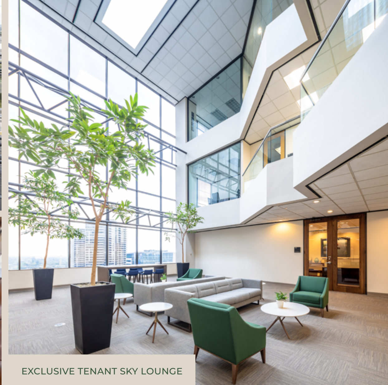
EXCLUSIVE TENANT SKY LOUNGE