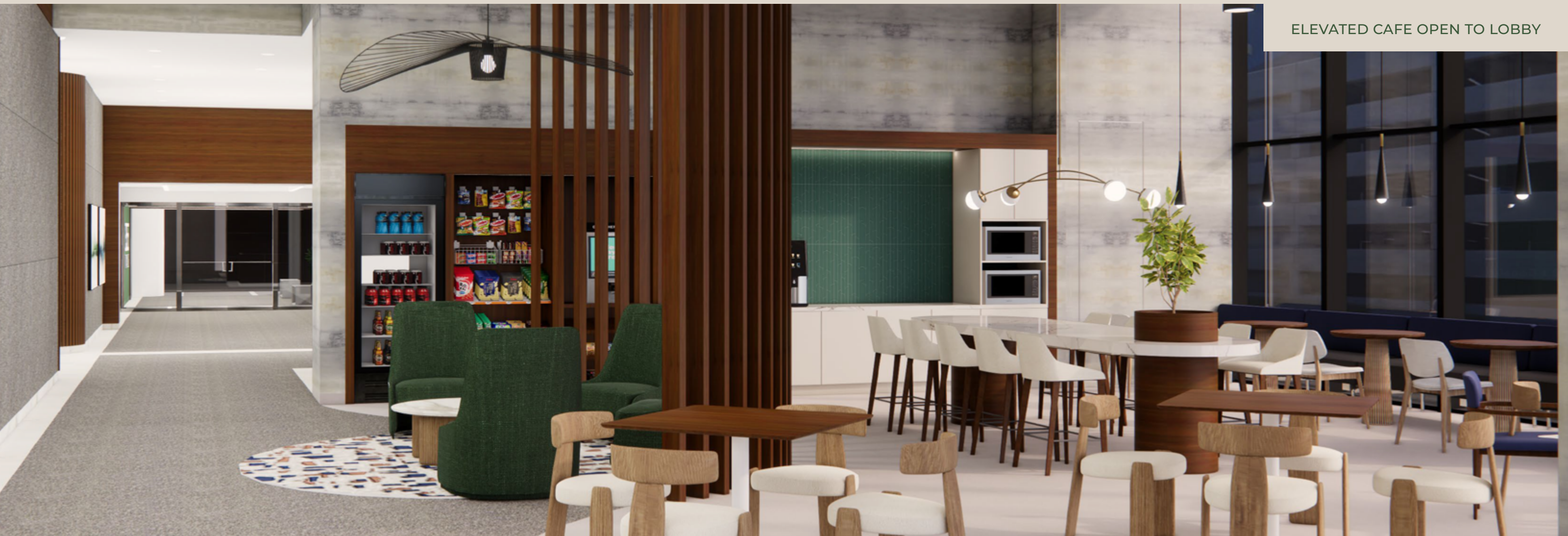
ELEVATED CAFE OPEN TO LOBBY