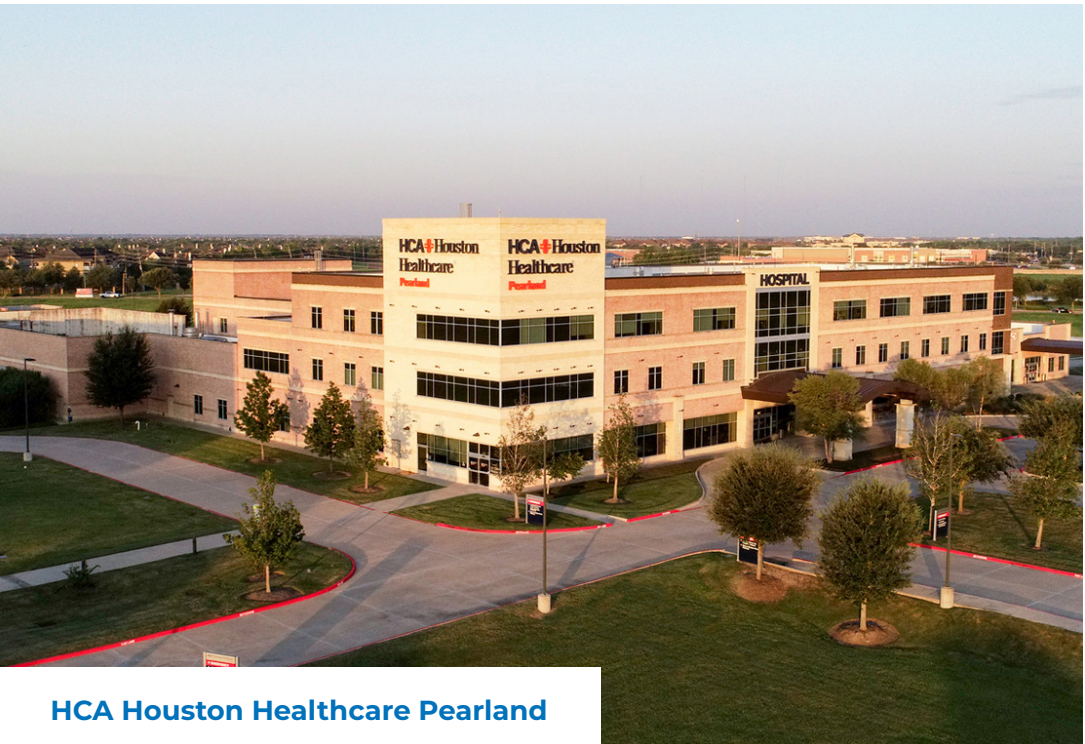
HCA Houston Healthcare Pearland