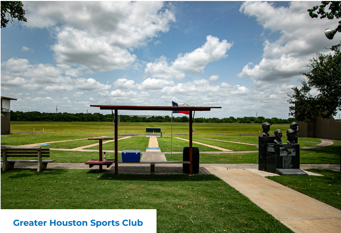
Greater Houston Sports Club