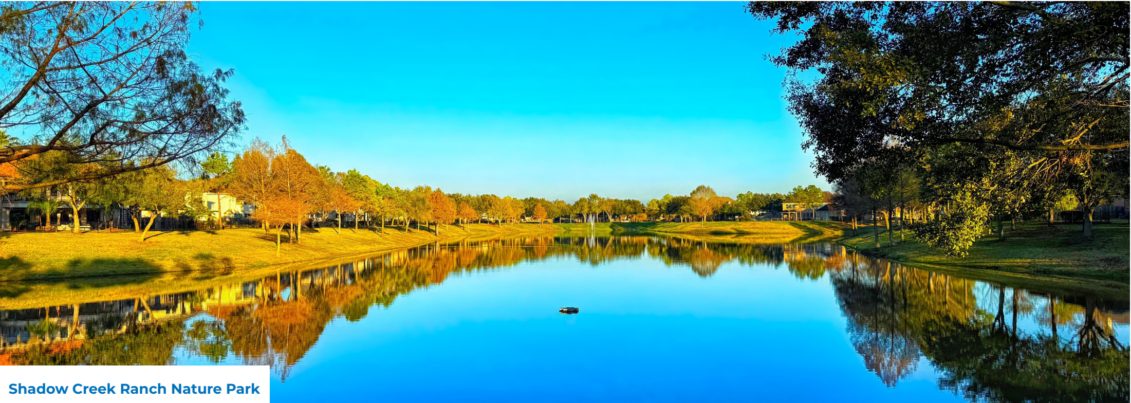
Shadow Creek Ranch Nature Park

Pearland is a vibrant and fast-growing community located just south of Houston, known for its welcoming atmosphere and strong sense of community. Surrounded by scenic parks, nature trails, and recreational spaces, Pearland offers residents a perfect blend of suburban comfort and outdoor enjoyment. The city continues to expand with thoughtfully planned neighborhoods, top-rated schools, and a wide range of family-friendly amenities. Its strategic location near major highways and the Texas Medical Center makes Pearland an attractive destination for both families and businesses seeking convenience, opportunity, and quality of life.