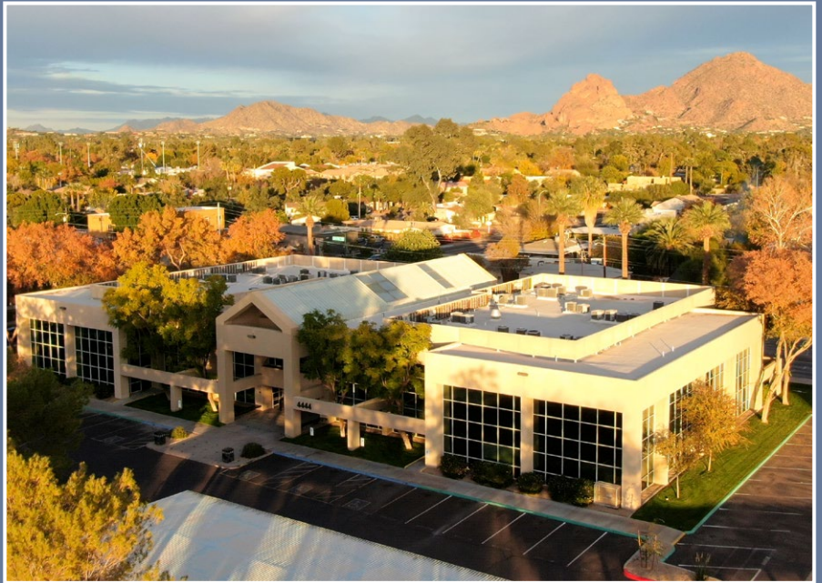
SUITE 220 – 2,352 RSF