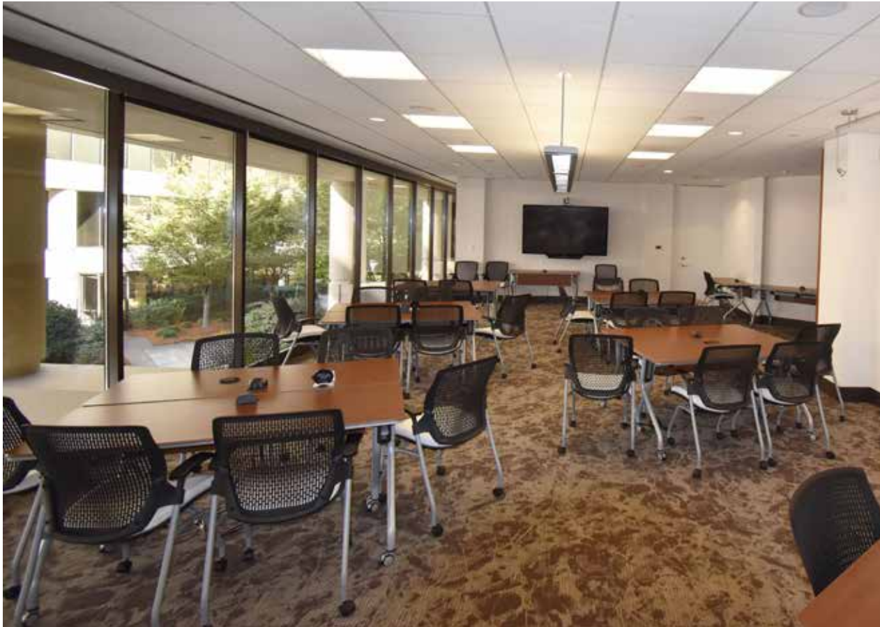
RECENTLY COMPLETED CONFERENCE CENTER SEATING UP TO 50 PEOPLE WITH STATE OF THE ART AV EQUIPMENT