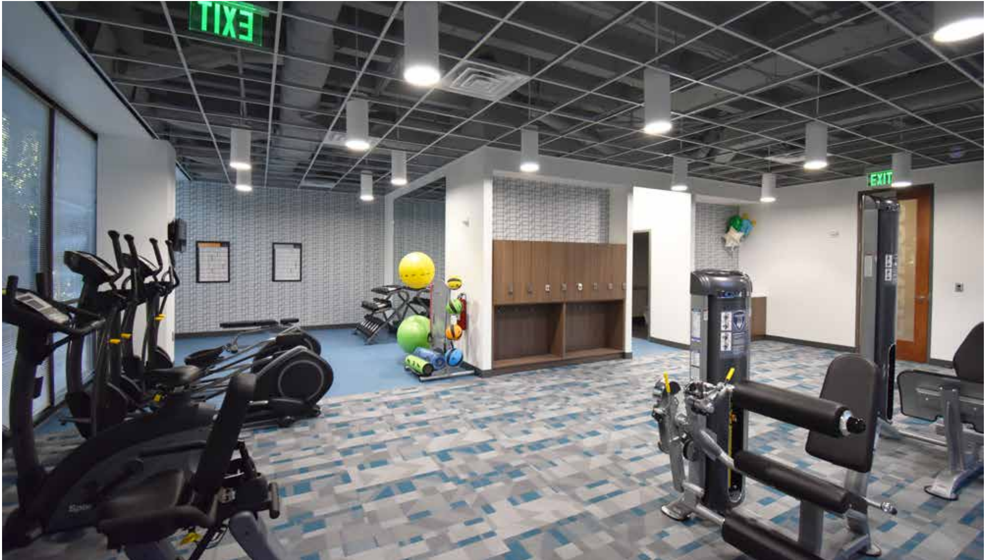
RECENTLY COMPLETED FULLY EQUIPPED FITNESS FACILITY WITH LOCKERS AND SHOWERS