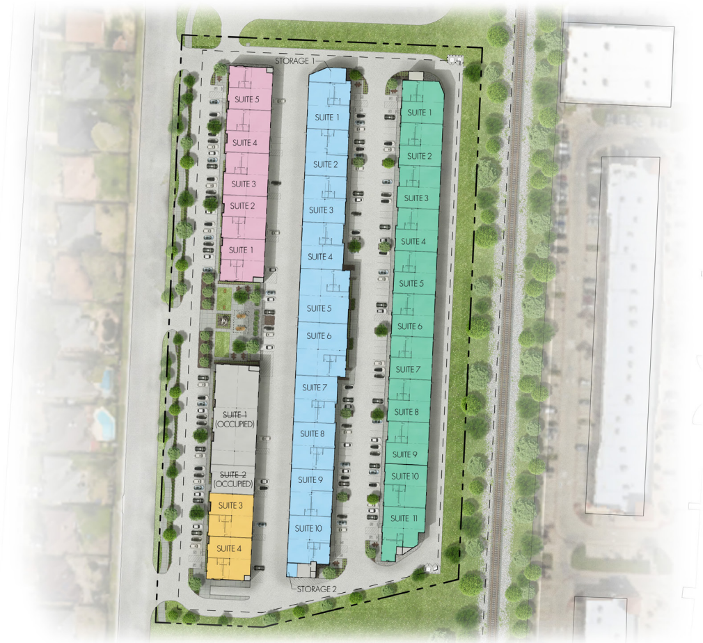
777 CHISHOLM TRAIL SITE PLAN Scale: 1" = 100'