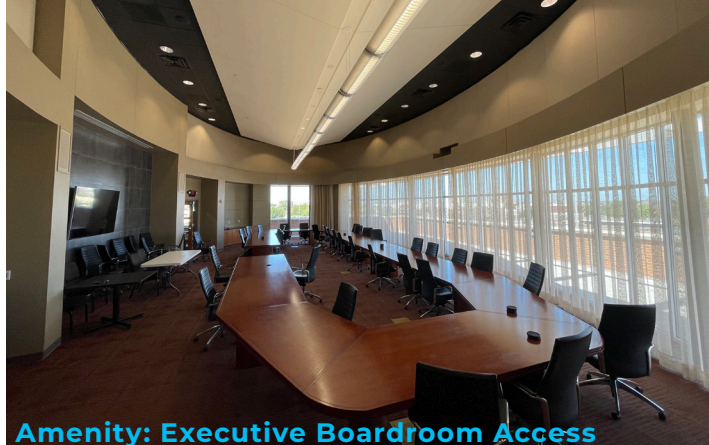
Amenity: Executive Boardroom Access