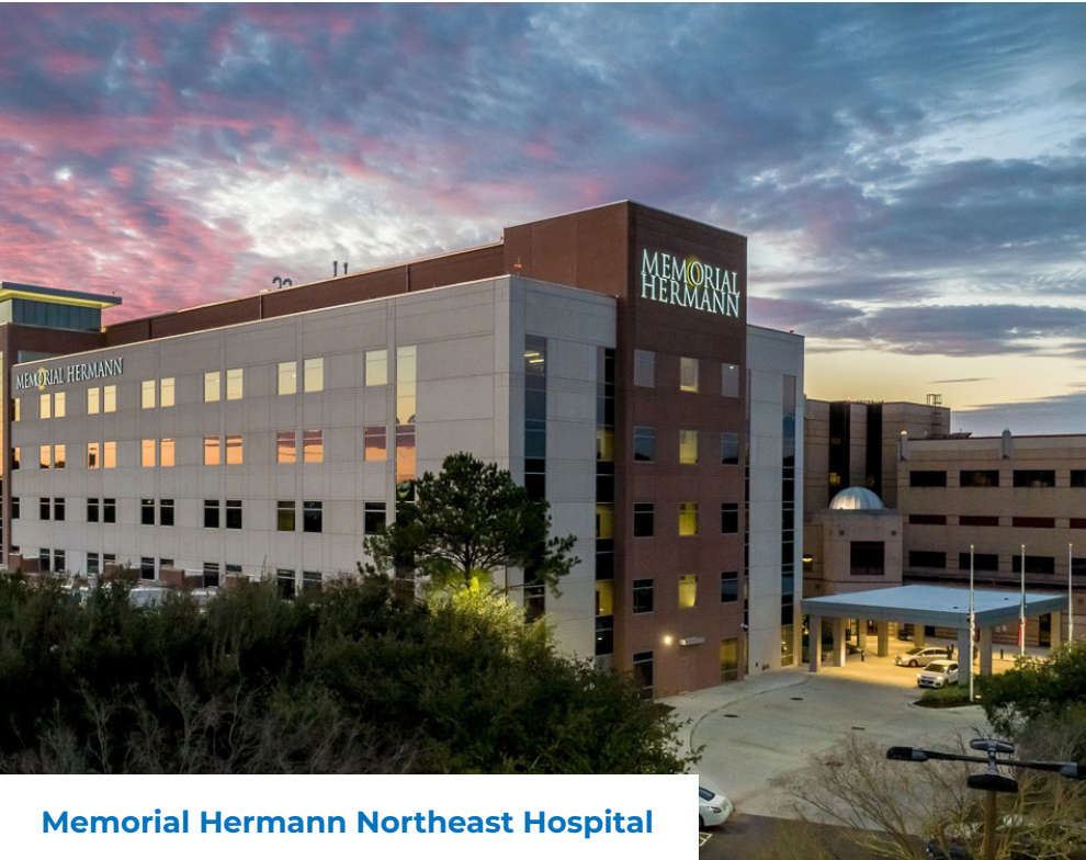
Memorial Hermann Northeast Hospital