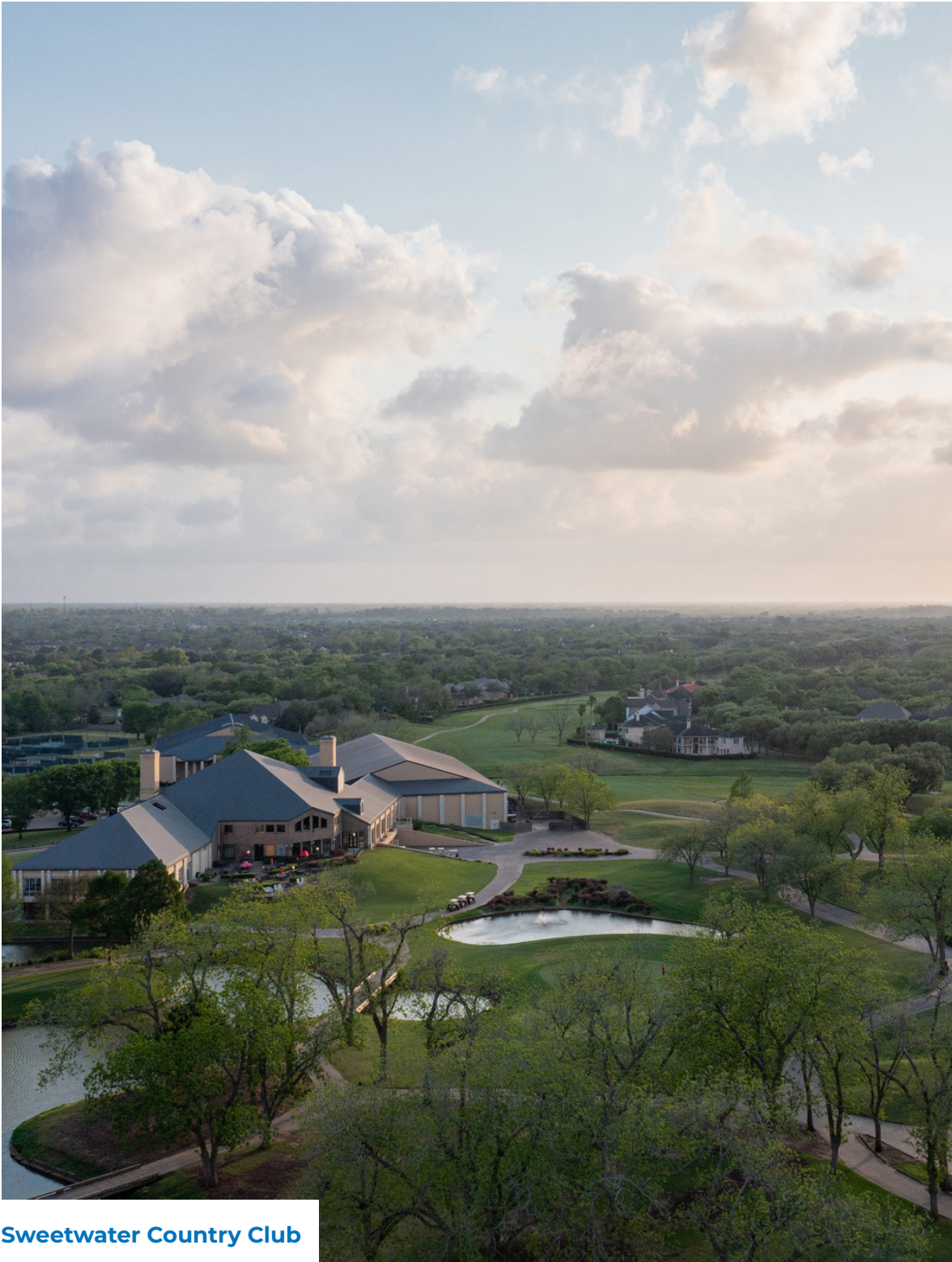
Sweetwater Country Club

The Rotunda Building is situated within Houston’s thriving and diverse communities, just a short distance from major medical facilities. Residents are well-educated professionals with higher-than-average household incomes, making the area an ideal location for healthcare services. The region continues to experience steady growth, with ongoing developments enhancing its appeal for businesses and medical practices alike.