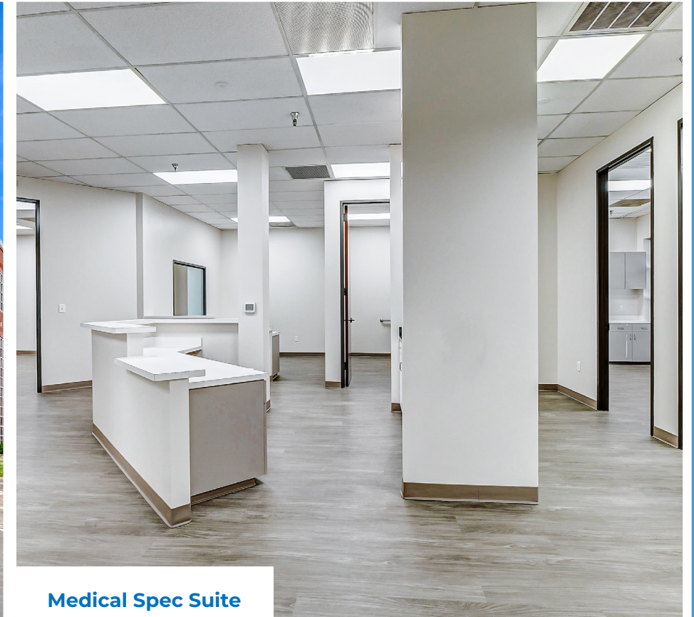
Medical Spec Suite