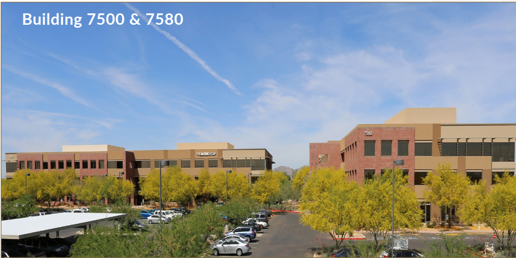
Building 7500 & 7580