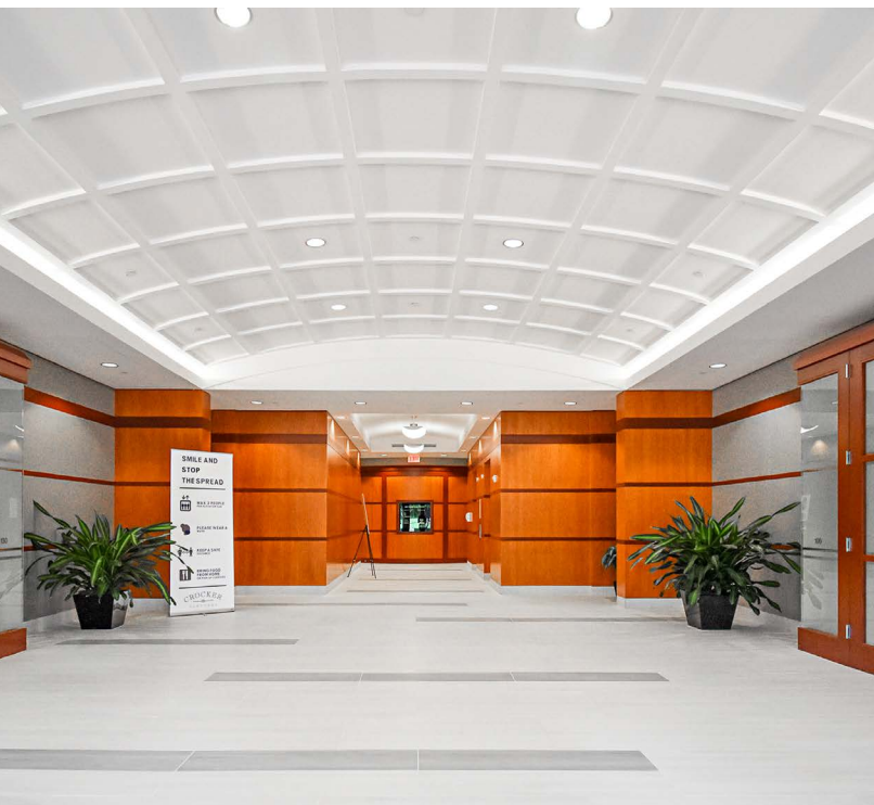
Bright and welcoming lobby