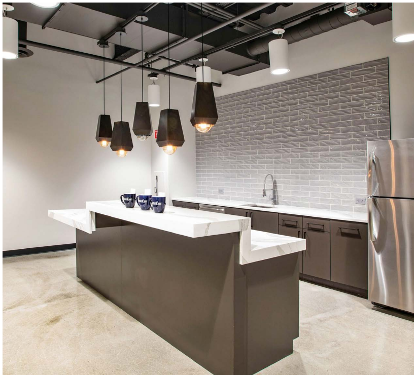
Open break rooms for space and gathering