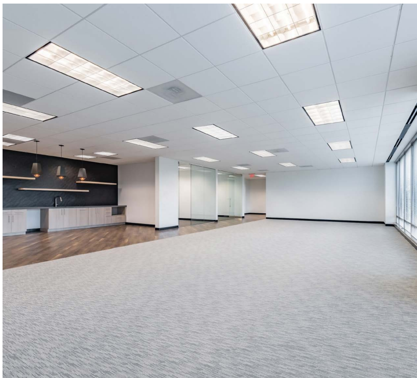
Range of spatial build-outs

For leasing information, please contact: