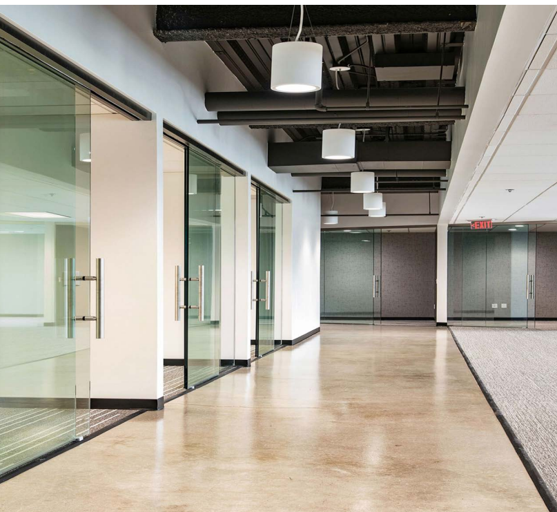
Range of contemporary finishes and lighting fixtures