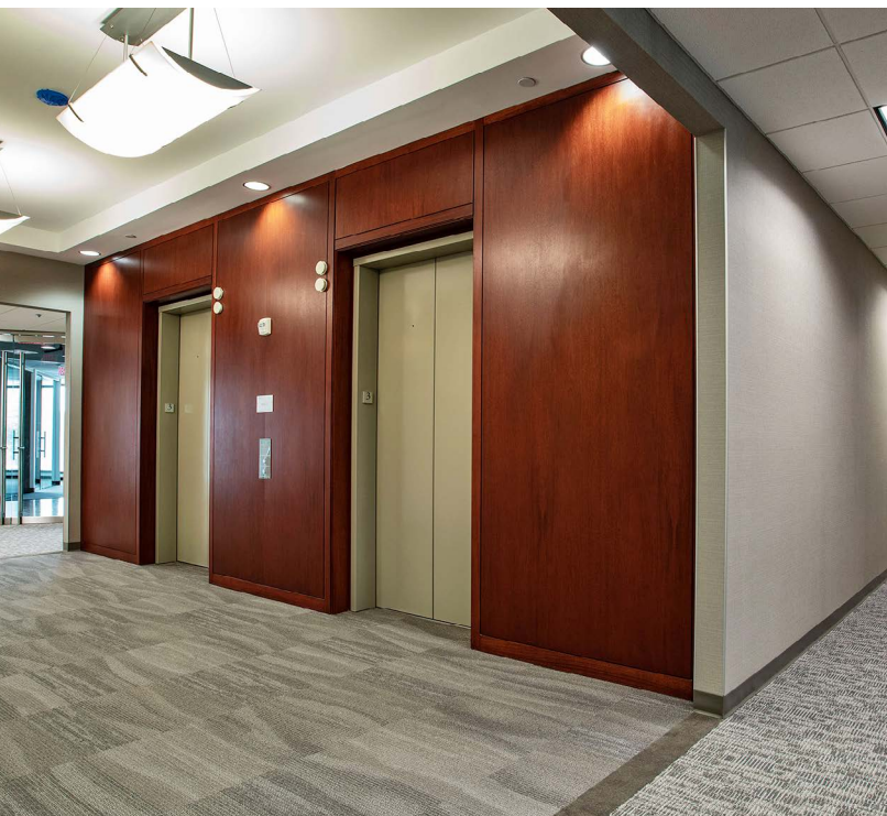
Select renovated elevator lobbies and floor corridors