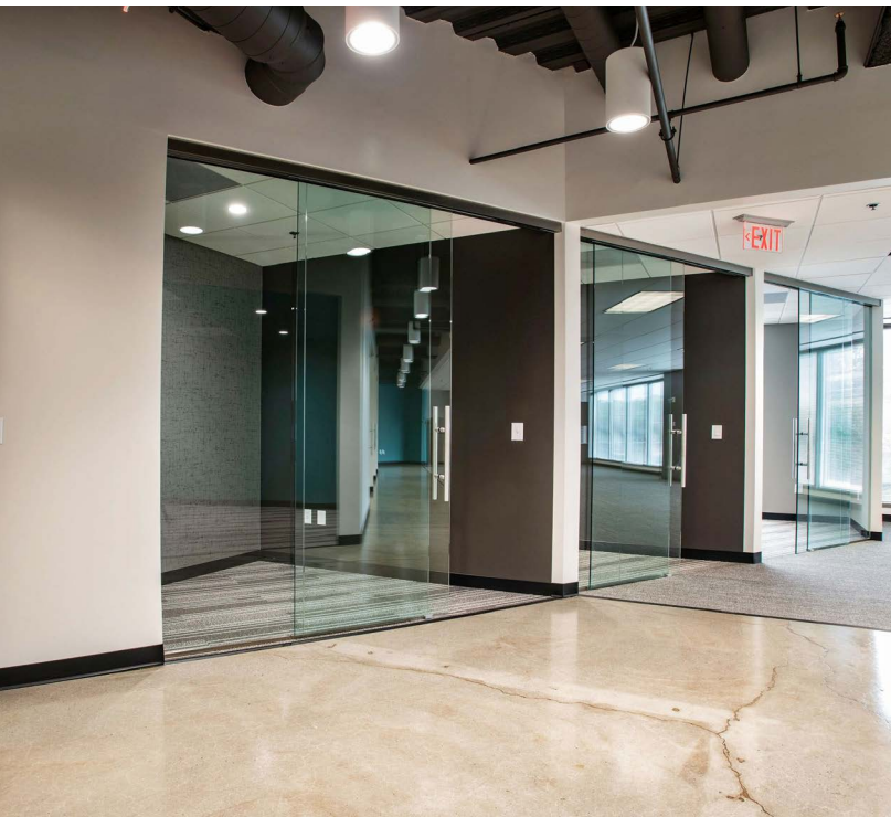
Premium entries and stand out first impressions