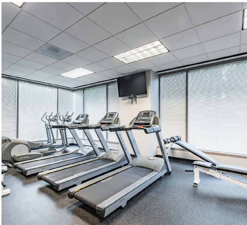
Cardio-focused communal fitness center