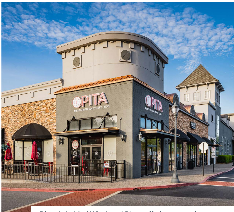
Directly behind Windward Plaza, offering convenient walkability to fast-casual dining and services

For leasing information, please contact: