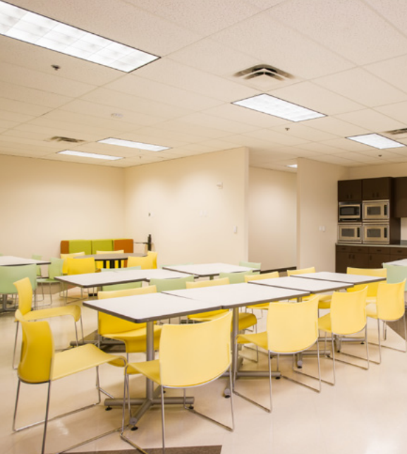
Suite 220 - 9,550 RSF