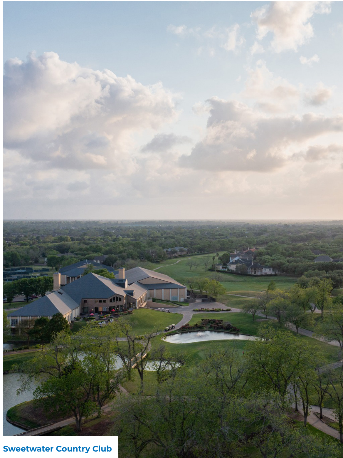
Sweetwater Country Club

The Offices at Sweetwater is situated within Houston's thriving and diverse communities, just a short distance from major medical facilities. Residents are well-educated professionals with higher-than-average household incomes, making the area an ideal location for healthcare services. The region continues to experience steady growth, with ongoing developments enhancing its appeal for businesses and medical practices alike.