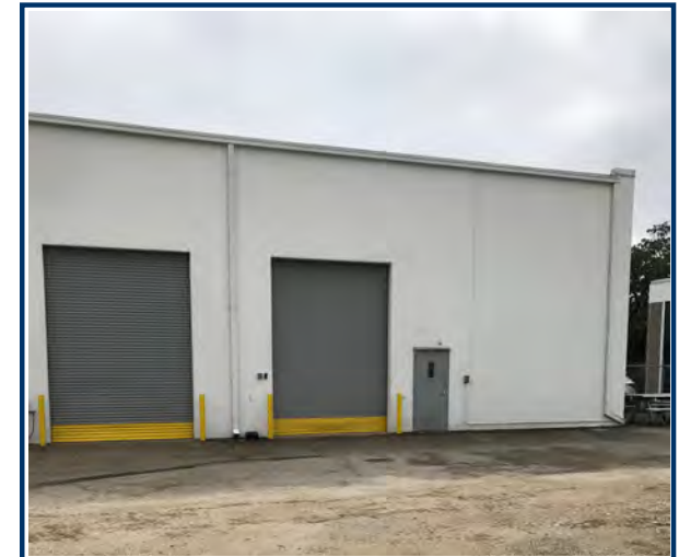
Grade Level Doors to Warehouse