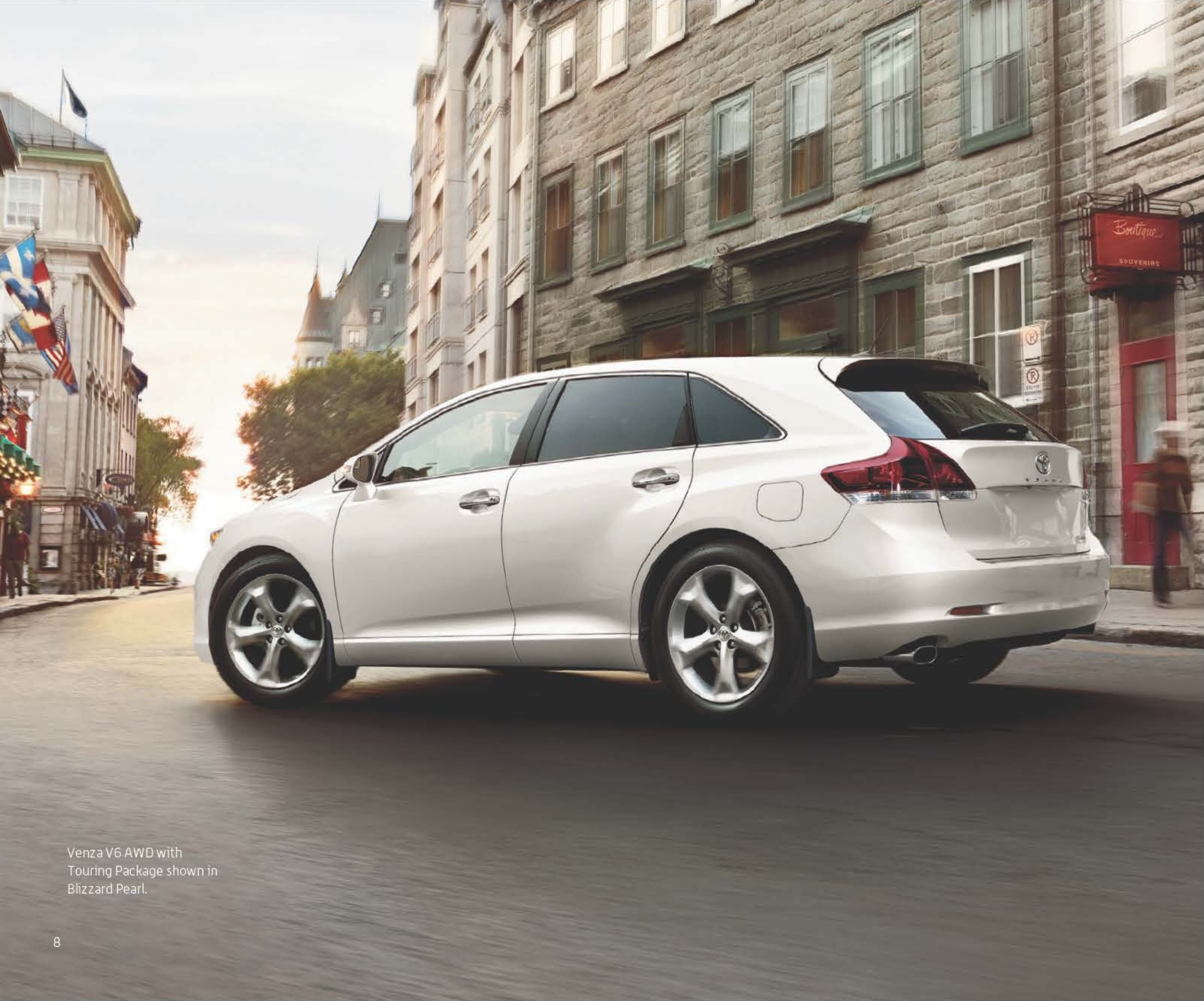
Venza V6 AWD with Touring Package shown in Blizzard Pearl.