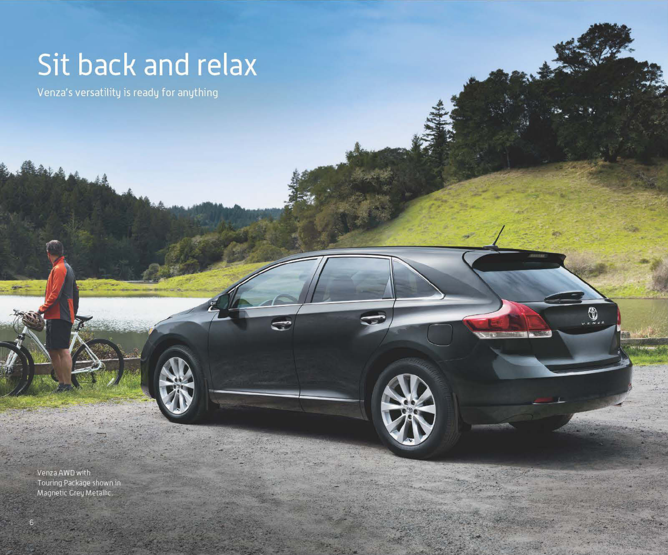
Venza AWD with Touring Package shown in Magnetic Grey Metallic.

Venza's versatility is ready for anything