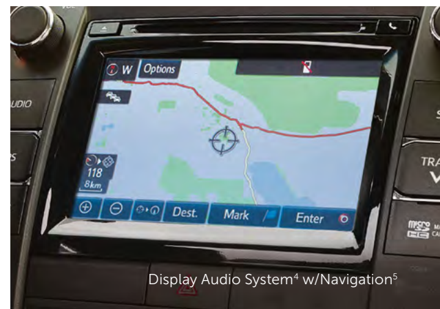
Display Audio System 4 w/Navigation 5