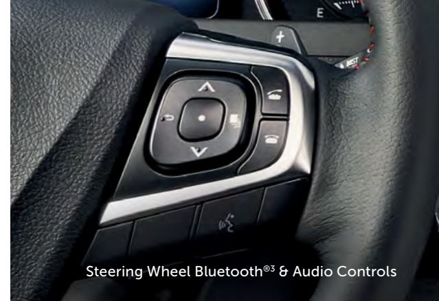
Steering Wheel Bluetooth® & Audio Controls

What can the Camry do for you? It can talk, listen, inform, entertain, and amaze. It can infuse technology into just about every moment of every trip. It can turn on with the push of a button. It can charge your phone wirelessly while you drive. It can revolutionize the way you drive, with technology that can take you to the other side of the country as easily as it takes you around a traffic jam. The Camry can take you wherever you've dreamed of going, now and into the future.