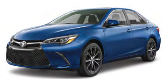
8T7 BLUE STREAK METALLIC