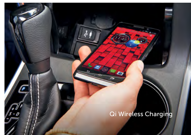
Qi Wireless Charging