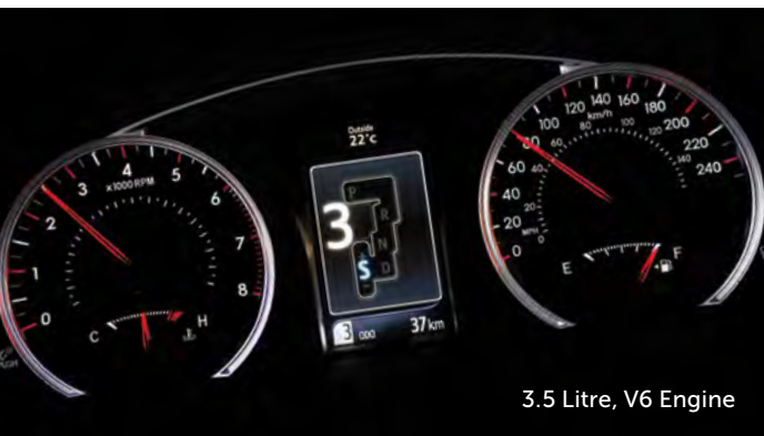
3.5 Litre, V6 Engine