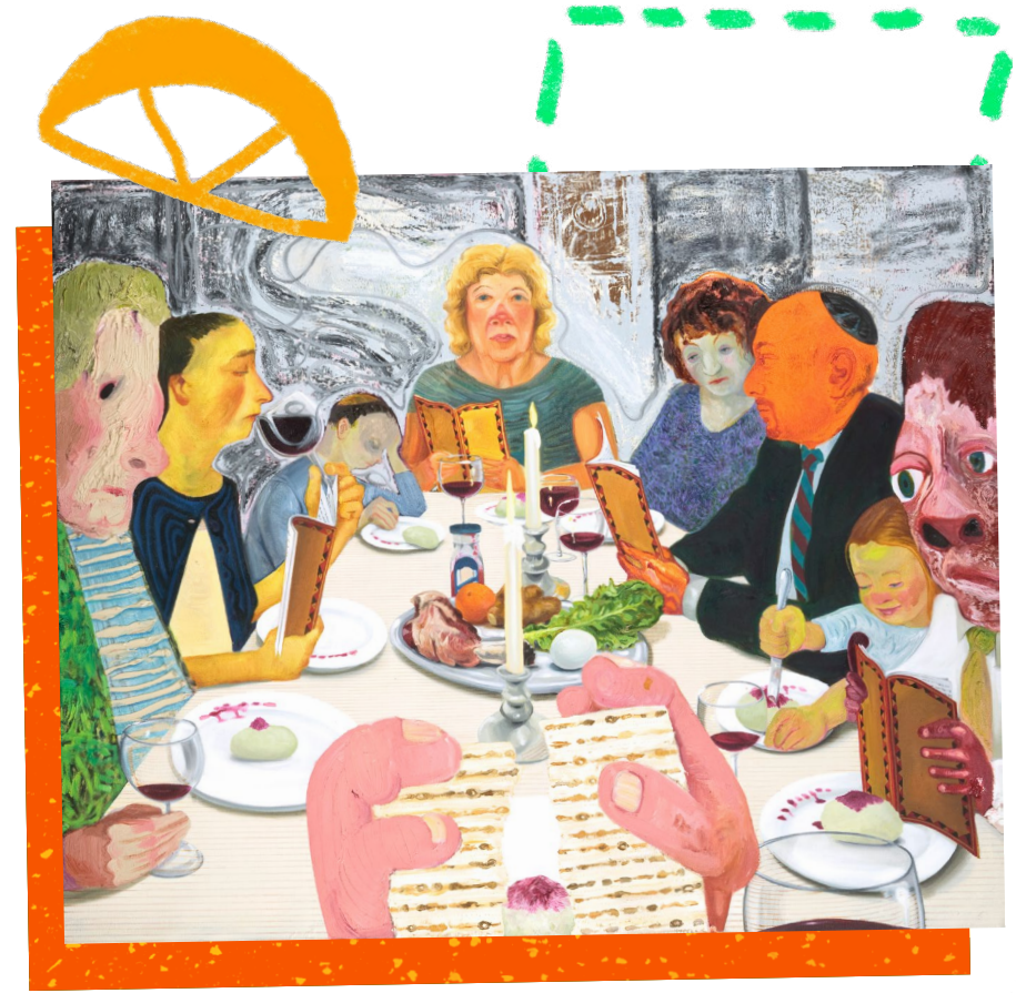
Nicole Eisenman, Seder , 2010. Oil on canvas. The Jewish Museum, New York. Purchase: Lore Ross Bequest; Milton and Miriam Handler Endowment Fund; and Fine Arts Acquisitions Committee Fund. Artwork © Nicole Eisenman.

A Seder is a meal that takes place during the Jewish holiday of Passover and involves the retelling of a story in the Book of Exodus, part of the Hebrew Bible. The story describes how the Israelites escaped from a life of slavery in ancient Egypt. Family and friends read from a book called a Haggadah. They sing songs together and eat special foods.