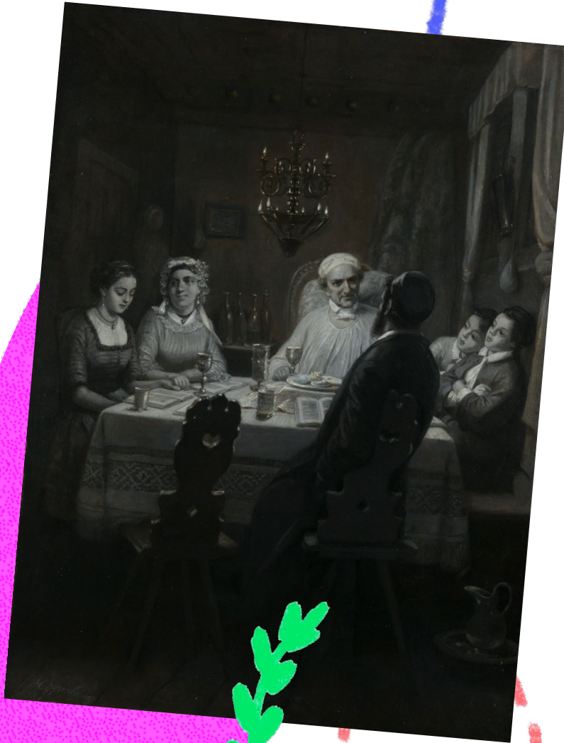
Moritz Daniel Oppenheim, Seder (The Passover Meal) (Der Oster-Abend) , 1867. Oil on paper on canvas. The Jewish Museum, New York. Gift of the Oscar and Regina Gruss Charitable and Educational Foundation, Inc.

A Seder is a meal that takes place during the Jewish holiday of Passover and involves the retelling of a story in the Book of Exodus, part of the Hebrew Bible. The story describes how the Israelites escaped from a life of slavery in ancient Egypt. Family and friends read from a book called a Haggadah. They sing songs together and eat special foods.