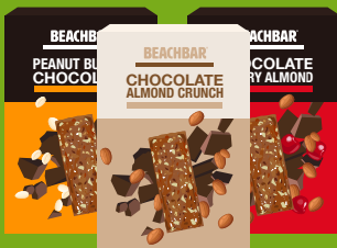
BEACHBAR Subscription (3-carton only)