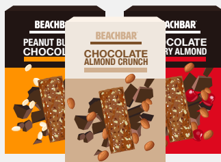
BEACHBAR Subscription (3-carton only)