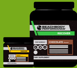
Beachbody Performance® subscription

The most important part of Beachbody's total solution is nutrition. You must also have a personal subscription order of at least 90 PV*.