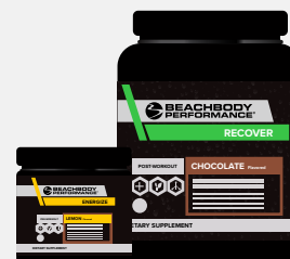
Beachbody Performance® subscription