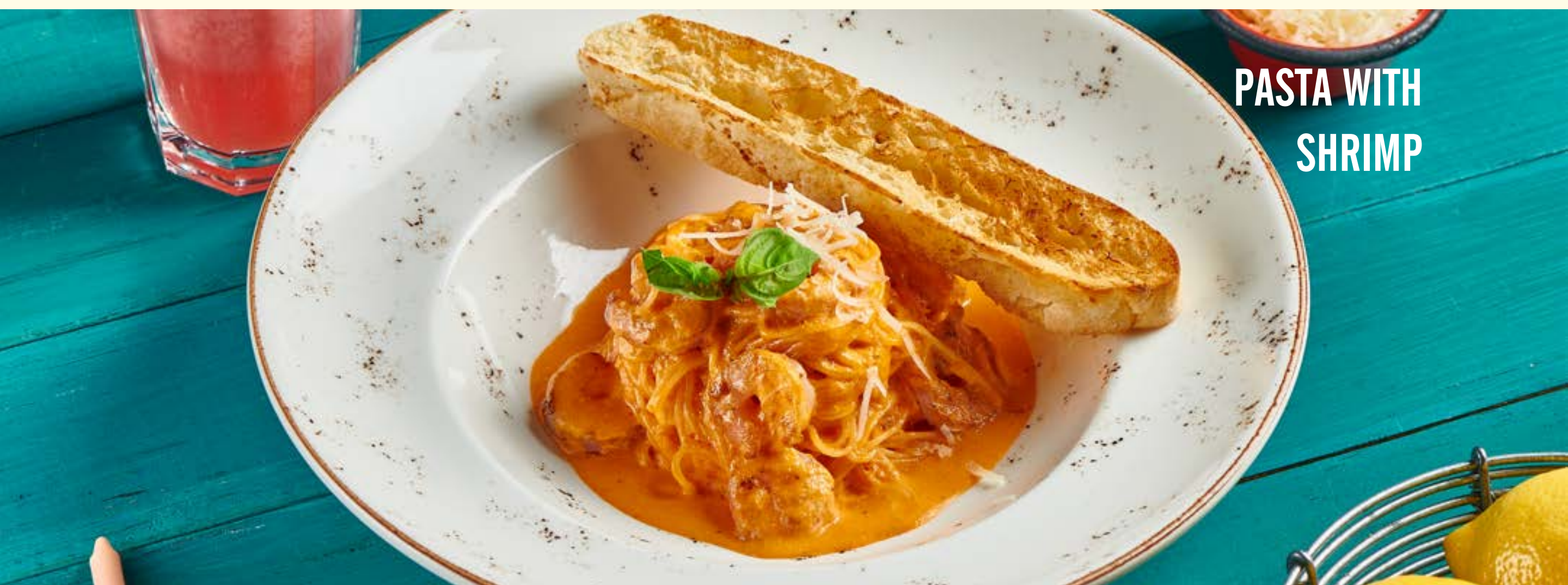
PASTA WITH SHRIMP