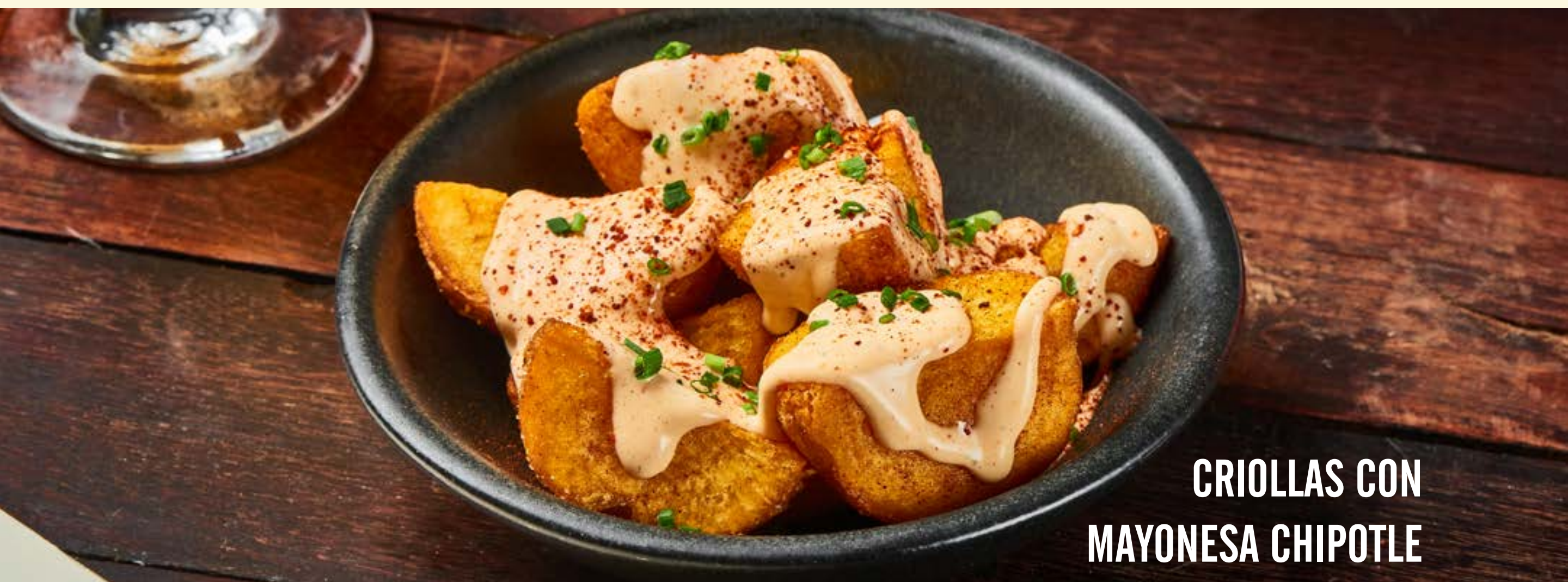
CRIOLLAS CON MAYONESA CHIPOTLE