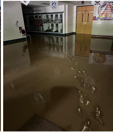
Knott Central High School