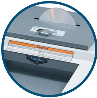
Dedicated Infeeds Two dedicated feed openings for paper, CD's, DVD's, USBs

The FD 8704CC Multimedia Office Shredder combines shredding power with a compact, rugged design. Two dedicated feed openings shred paper and multimedia storage including CDs, DVDs, USB thumb drives, mini-DV tapes and ZIP/floppy disks . Standard features include heat-treated steel blades , a user-friend LED control panel , lifetime guaranteed waste bin , and a powerful AC geared-motor . In addition, the ECO Mode saves energy by automatically switching into standby mode after 5 minutes of inactivity. The optional EvenFlow™ Automatic Oiling System helps to keep the FD 8704CC in peak operating condition.