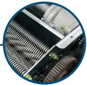
Commercial Grade Heat-treated solid steel cutting blades, all metal gears, AC geared motor