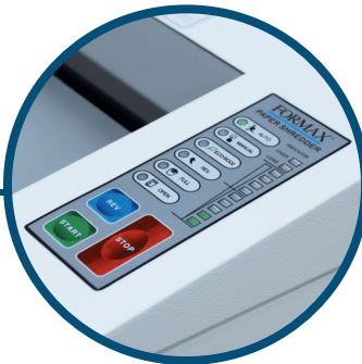
Easy-to-Use Control Panel Auto, Reverse, Bin Full Indicator, Load Indicator, ECO Mode